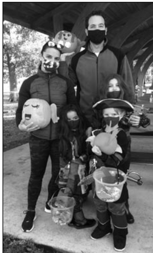
(above) Scenes from Fanwood's Halloween Haunted Candy Forest & Pumpkin Decorating event at La Grande Park