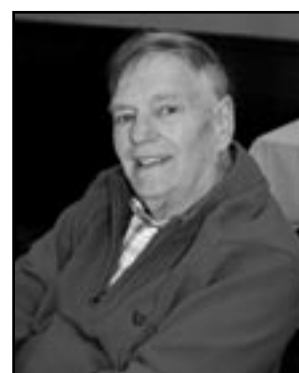
Wells Perkins Army