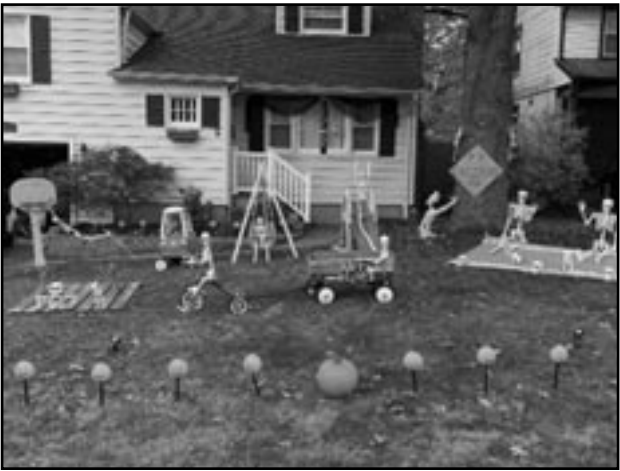
(above) Third Place (112 votes): 107 2nd Street, submitted by Matt!