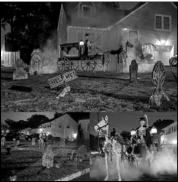
(above) Second Place (113 votes): 26 Chetwood Terrace, submitted by Melissa!