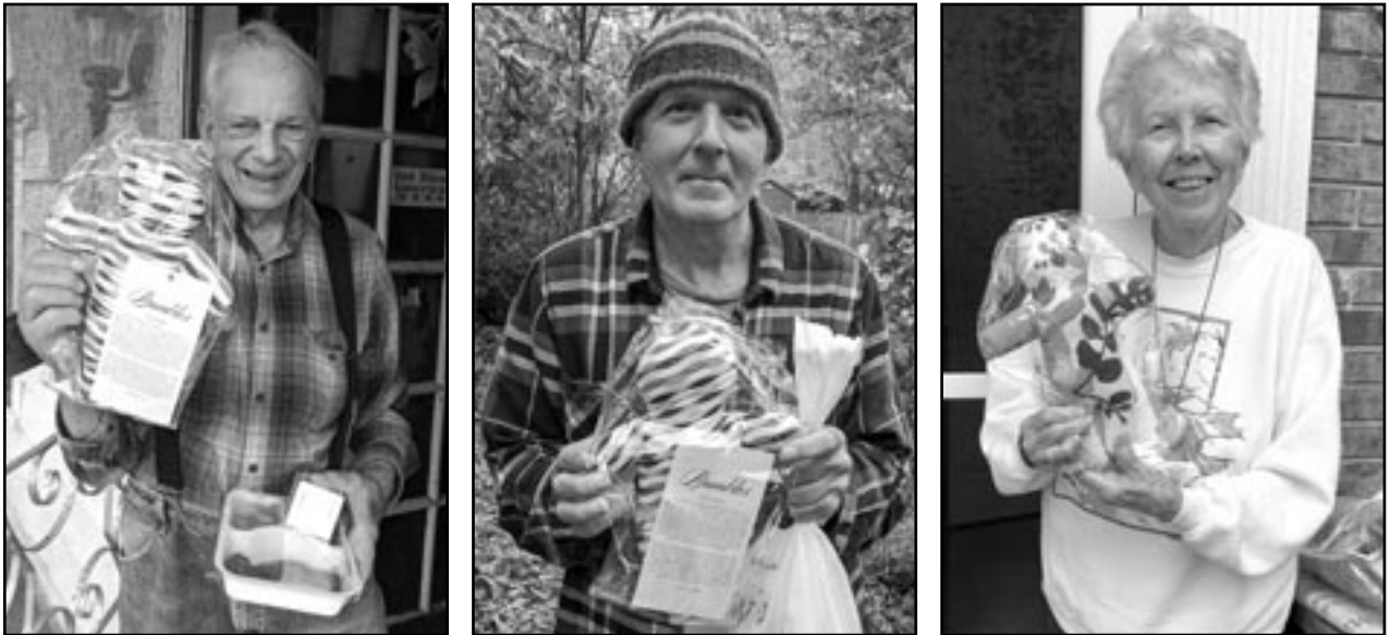
(above) SAGE Meals on Wheels clients holding dolls, made and donated by Bumbles Dolls in Summit.