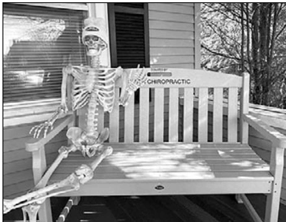
(above) Bench at Smith Chiropractic on Snyder Avenue.

At this time, the BHEC is resuming the town-wide thin-film plastics collection. “The