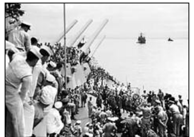
(above) Crew of USS Missouri watches the ceremony of the Surrender of Japan - VJ Day - September 2, 1945.