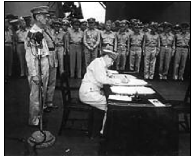
(above) Aboard the Missouri, Supreme Commander of Allied Forces Army Gen. Douglas MacArthur signed the Instrument of Surrender for the United Nations.