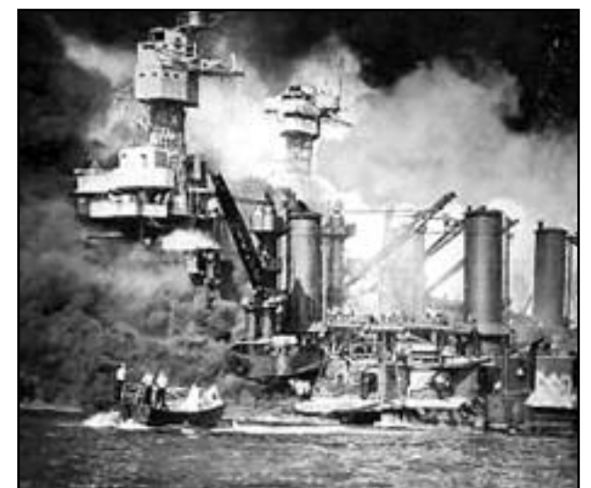
(above) Sailors in a small boat make a water rescue while an enormous ship burns in the background.