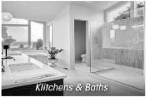
Kitchens & Baths