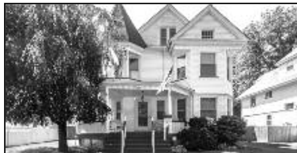
240 MAPLE AVENUE