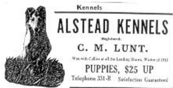
(above) Advertisement in a 1916-1917 Rahway City directory.