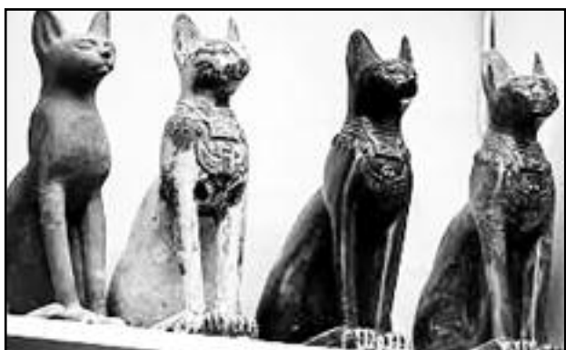
(above) Egyptian families loved their cats and mourned together when they died, very much like pet owners do today.