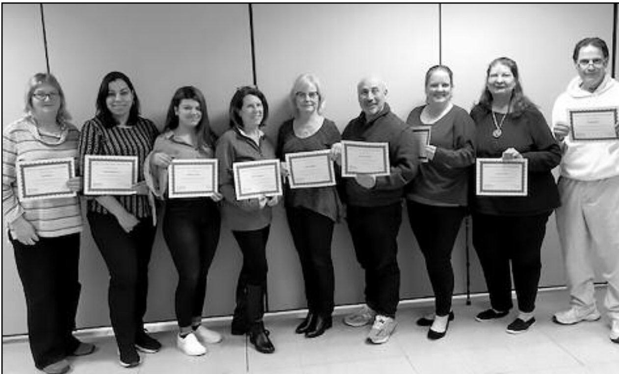
(above) Ten new volunteer tutors from Union County have completed their training and joined Literacy New Jersey as English as a Second Language tutors.

materials and activities as well as strategies for lesson planning. Previous teaching experience is not required. For more information on training and other opportunities at Literacy New Jersey, please call 908-486-1777 or email bbagger@literacynj.org .