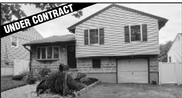
136 MADISON AVENUE