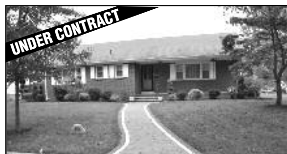
857 GROVE STREET

DON'T WAIT. CALL NOW FOR YOUR FREE HOME EVALUATION!!! INVENTORY IS LOW. GET TOP DOLLAR FOR YOUR HOME. Call Today! (732) 381-1190