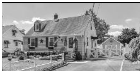
1146 STONE STREET