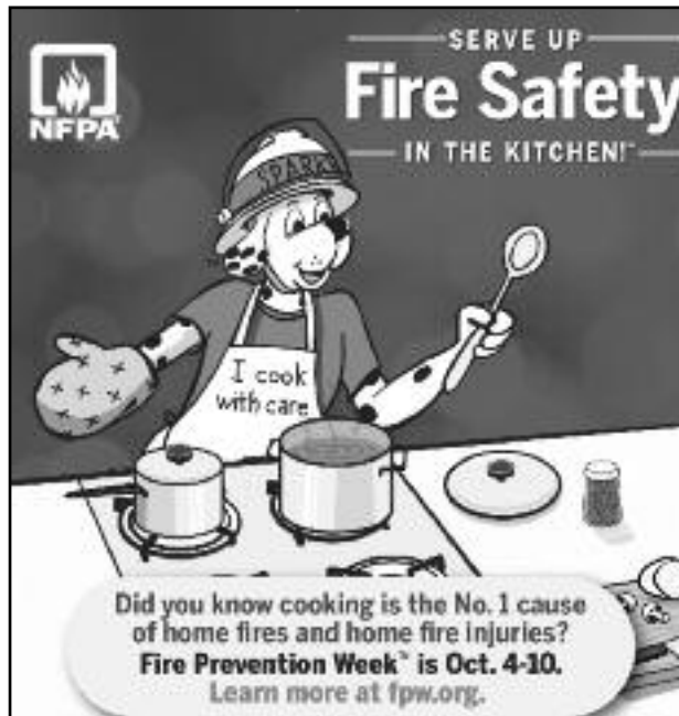
(above) The National Fire Prevention Association is focused on the theme "serving up fire safety in the kitchen" this year.

For more information on fire safety programs, visit NFPA.org.