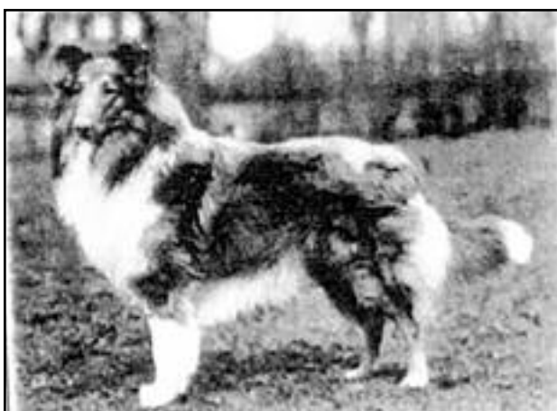
(above) One of Alstead's champions – Ch. Alstead Spotland Sterling