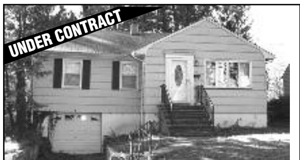
262 PLAINFIELD AVENUE