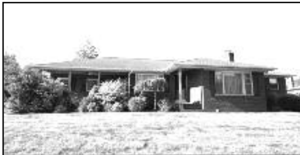
1042 W LAKE AVENUE