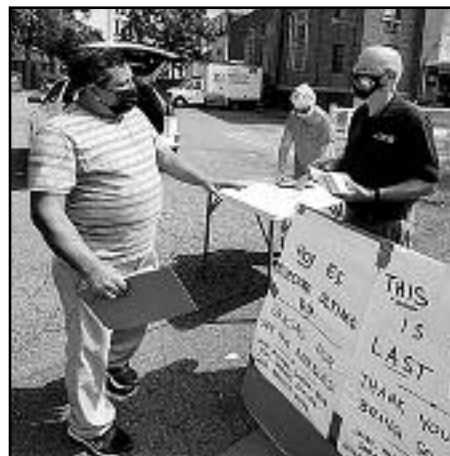
(above) Rotarians and volunteers prepare to give away ShopRite gift cards to families and individuals in Plainfield as part of the Plainfield Food Security Project.

"Thank you for all the help you have provided to the Plainfield community, my family and many