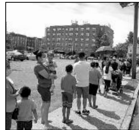
(above) Plainfield residents wait in line patiently for their opportunity to receive a $50.00 ShopRite gift card, distributed by the Rotary Club of the Plainfields for the Plainfield Food Security Project.

more. May God bless you all and thank you for everything."