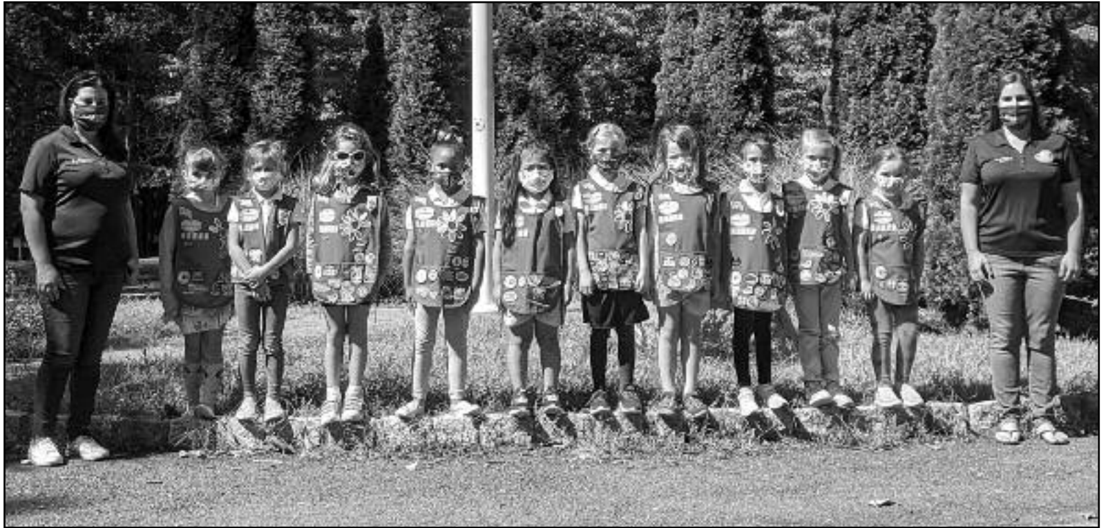
(above) Garwood Daisy Troop #41108