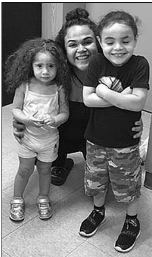
(above) Families and individuals shared their "Y stories" for the 120th anniversary of The Gateway Family YMCA.

In May, The Gateway Family YMCA announced the launch of a story collection project to collect 120 "Y Stories" to celebrate 120 years of serving the community in June 2020. Through an overwhelming response, The Gateway Family YMCA was able to share 120 stories throughout the month of June and continued to share those stories throughout July.