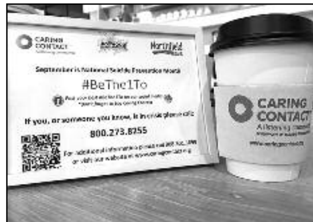
(above) Caring Contact, with support from Northfield Bank, is offering Awareness Coffee Sleeves in area coffee shops to help raise awareness about suicide during National Suicide Prevention Month.

Jersey. As a member agency of the National Suicide Prevention Lifeline and the International Council for Helplines, Caring Contact compassionately serves those in emotional distress and educates local communities about the power of personal connection. In 2019, hotline volunteers responded to nearly 13,000 calls through the caring and crisis line. For more information please visit caringcontact.org . If you, or someone you know, is in crisis, please call 800-273-8255.