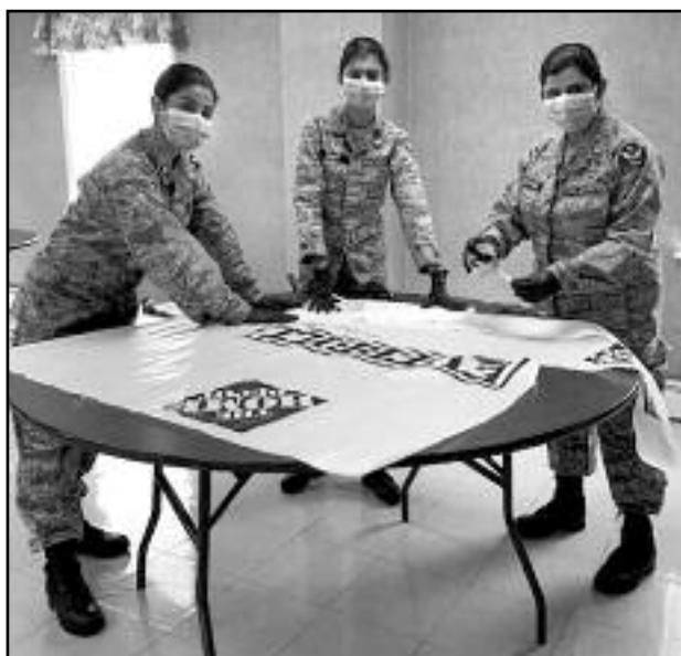
(above) The Captain "Bud" Jackson Composite Squadron continues in their volunteer efforts during the pandemic.

PRSR STD U.S. POSTAGE PAID BRIDGEPORT CT PERMIT NO. 390 EGRWSS