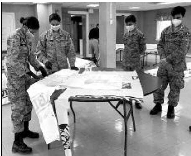
(above) C.A.P members have volunteered with the Hillside Food Bank and Egg Harbor Food Bank, packaging food for people in need.