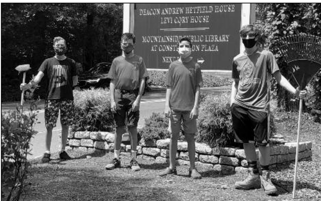
(above) Last month, scouts from Mountainside Boy Scout Troop 177 earned community service hours beautifying the area along New Providence Road behind the Deacon Andrew Hetfield House while earning valuable community service hours.

For information on Mountainside Historic Committee events or to donate funds, please email hetfieldhouse1@yahoo.com ; call 908-789-9420; or, go to: mountainsidehistory.org .