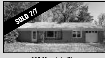
110 Mountain Pkwy Listed by Roseann