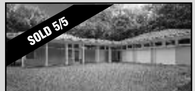
222 Greenbrook Road Listed by Roseann