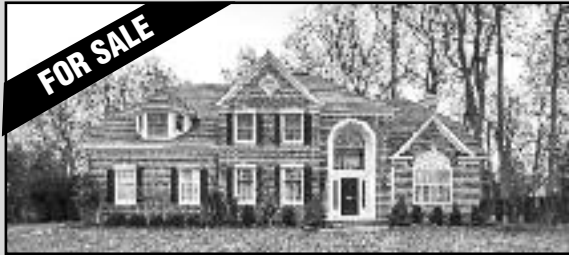
1 Bayview Terrace, Green Brook New kitchen and all hardwood floors 4 Beds / 3.1 Baths / $799,000