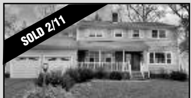
256 Greenbrook Road Buyer Agent Roseann