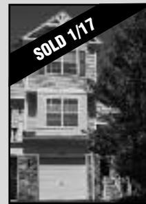
1096 Shadowlawn Drive Listed by Roseann