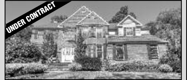
9 Ridge Road, Green Brook Meticulously appointed home 4 Beds / 3.1 Baths / $919,000