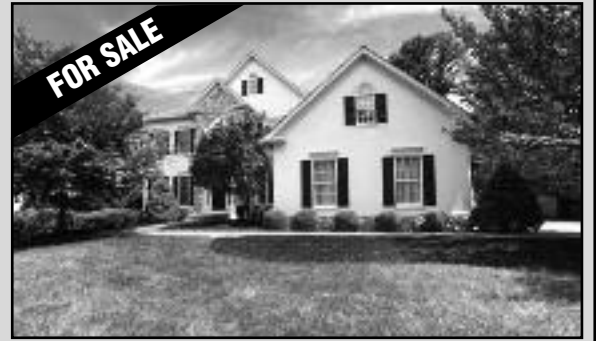
60 Ridge Road, Green Brook Meticulously updated colonial w/ in-law suite 6 Beds / 4.1 Baths / 3 Car Garage / $905,000

The real estate market is thriving due to historically low interest rates, compounded by buyers' need for more space in order to work remotely and the uptick in potential buyers relocating from the New York area. There is not enough inventory to satisfy the buyer needs for housing causing a boom in our market. If you are considering selling your home, now may be a good time to invite me in for a no obligation conversation about your needs. Our meeting is always confidential and without sales pressure.