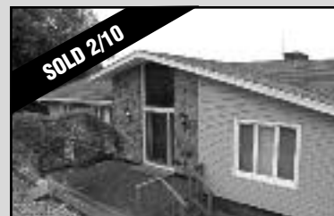
308 Warrentown Road Buyer agent Roseann