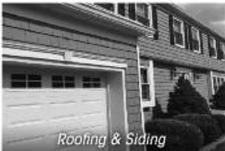
Roofing & Siding