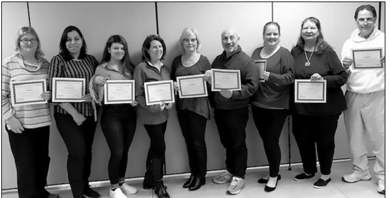
(above) Ten new volunteer tutors from Union County have completed their training and joined Literacy New Jersey as English as a Second Language tutors.

Literacy New Jersey runs tutor training twice a year, in January and September. The training provides a practical, hands on approach to working with adults, and includes ideas for materials and activities as well as strategies for lesson planning. Previous teaching experience is not required. For more information on training and other opportunities at Literacy New Jersey, please call 908-486-1777 or email bbagger@literacynj.org .