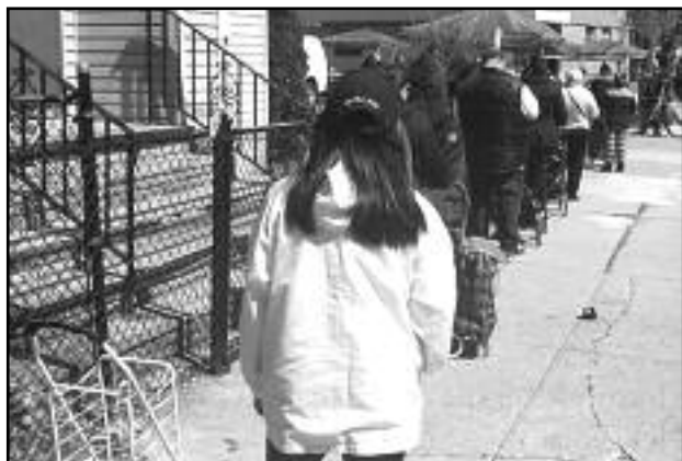
(above) Food distribution line at St. Joseph Social Service Center

With heartfelt thanks and appreciation, The Team at St. Joseph Social Service Center