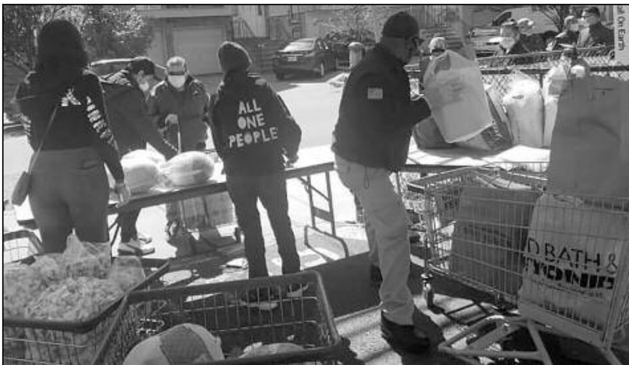
(above) Food being distributed at St. Joseph Social Service Center.