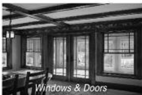
Windows & Doors