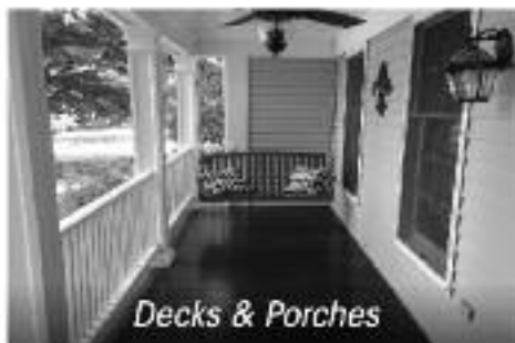
Decks & Porches