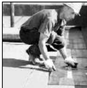
FLAT TOP ROOF