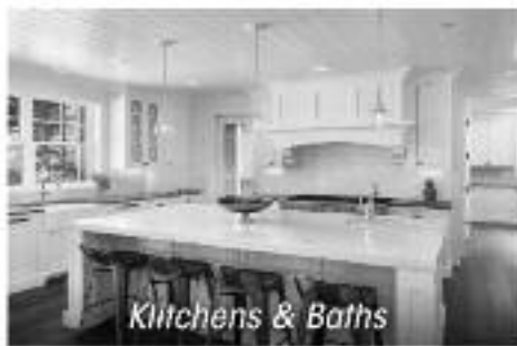
Kitchens & Baths