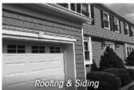
Roofing & Siding