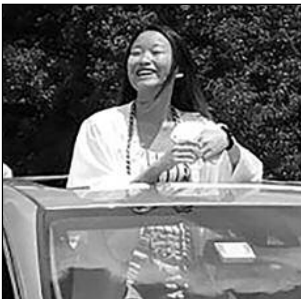
(above) Bright and sunny weather greeted Class of 2020 graduates for their special Car Parade Day.

The photo seems to echo the resolute spirit of the participants of the Class of 2020 Car Parade. It is also reminiscent of the "Senior GLC Bulletin Board" inside the school. The board was put up in September, and all year showed the signature self-confidence, personality and collective resolute spirit of the Class of 2020. It borrows a style used by the TV show, "Friends." Up top, the bulletin board head reads still, as it read all year: "Senior GLC, Season 20: Episode 20, The One Where They Graduate."