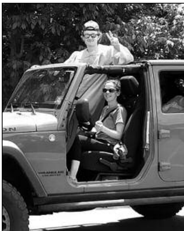
(above) Or another way to remember the say is to use the symbol for two levels of meaning: "Victory," sure, but also "Peace!"