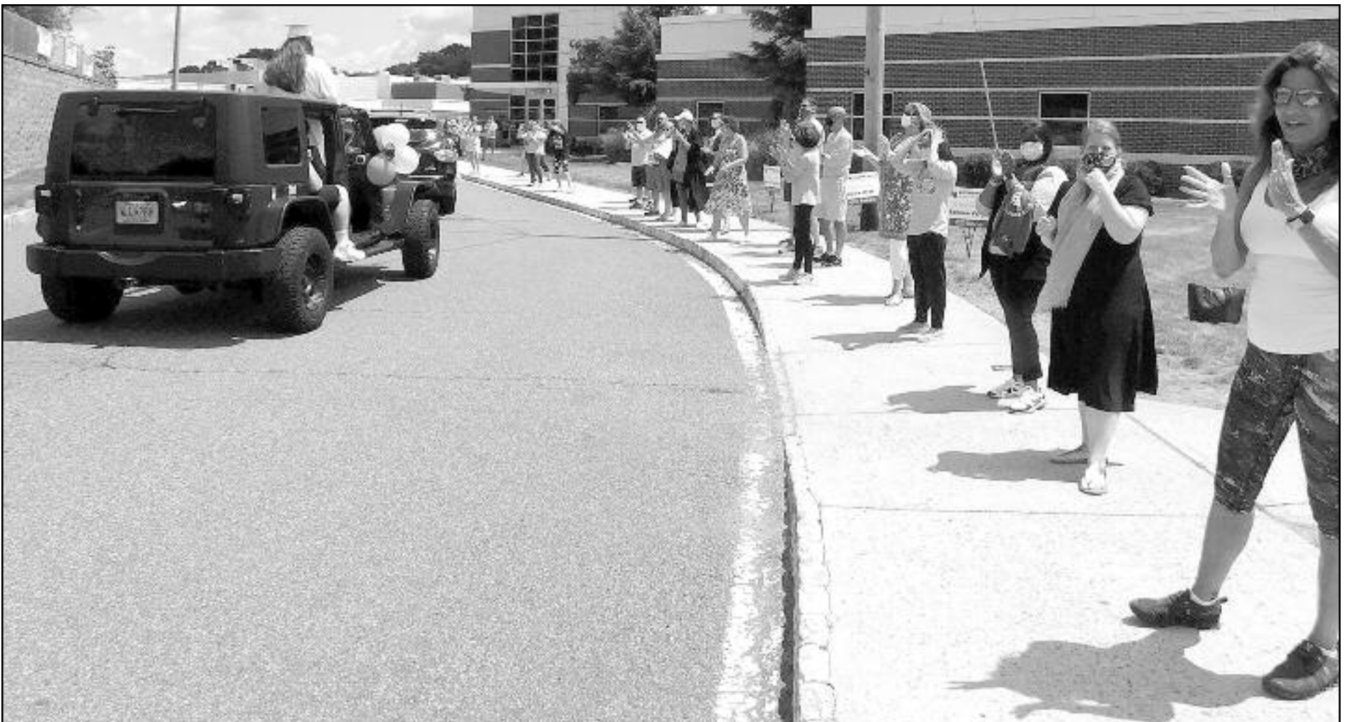
(above) Teachers, staffers, and well-wishers applaud Class of 2020 graduates as the Car Parade passes.