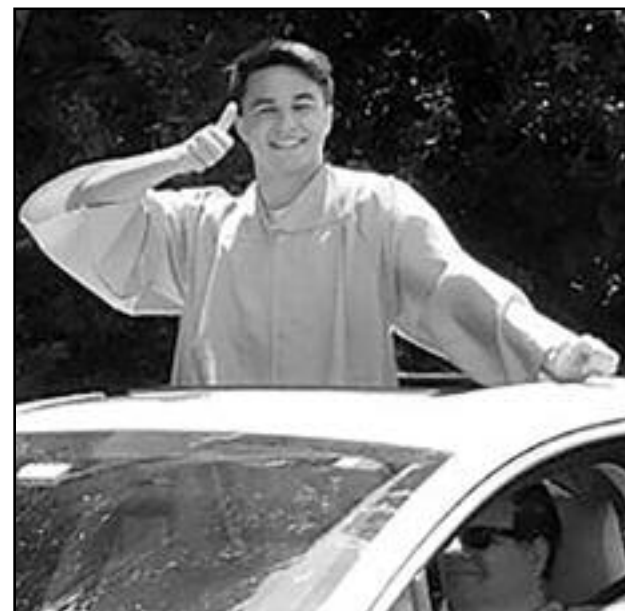
(above) What else is there to say, besides, "Thumbs Up!"