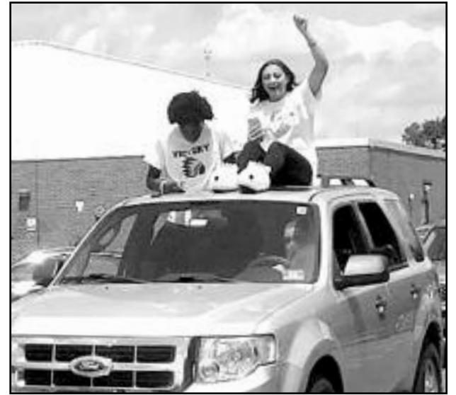
(above) For athletes, what else is there to say, besides, "Victory!"