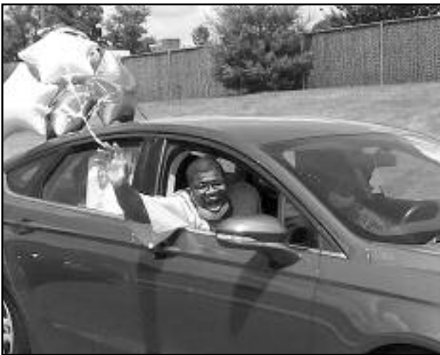
(above) So many Class of 2020 graduates were beaming from their cars as they passed well-wishers, they seemed to be saying they were ready to reach for the stars.