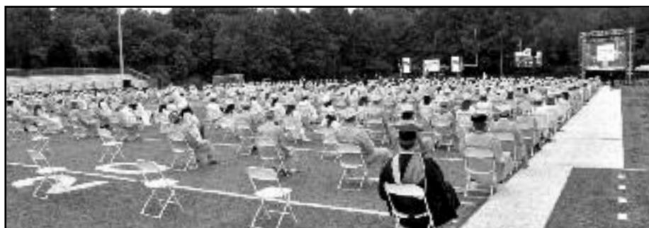
WHRHS, with the size of graduating seniors under 500, took full advantage of the 100 yards of its Stadium's artificial turf to seat the Class of 2020 with the required 6 feet between each student.

The Commencement was unofficially and effectively "Graduation Part II." On the day the Class of 2020 was originally scheduled to graduate before the COVID-19 Shutdown changed everything, Friday, June 19, the Class of 2020 participated in a Graduation Car Parade. That was the day a veritable sea of cars assembled in the Stirling Road-side parking lot in front of the WHRHS building. Beginning on about 11:45 a.m., Friday, June 19, the Car Parade ferried the Guests of Honor - the WHRHS Class of 2020 - in front of scores of applauding, cheering, encouraging teachers, staff and well-wishers. It took the better part of an hour for all the cars to complete the parade's route through campus. The participating students, often accompanied in their cars by parents, siblings, other relations and even for some with family pets. Everyone appeared to genuinely enjoy the opportunity to get together as a class for the first time since March.