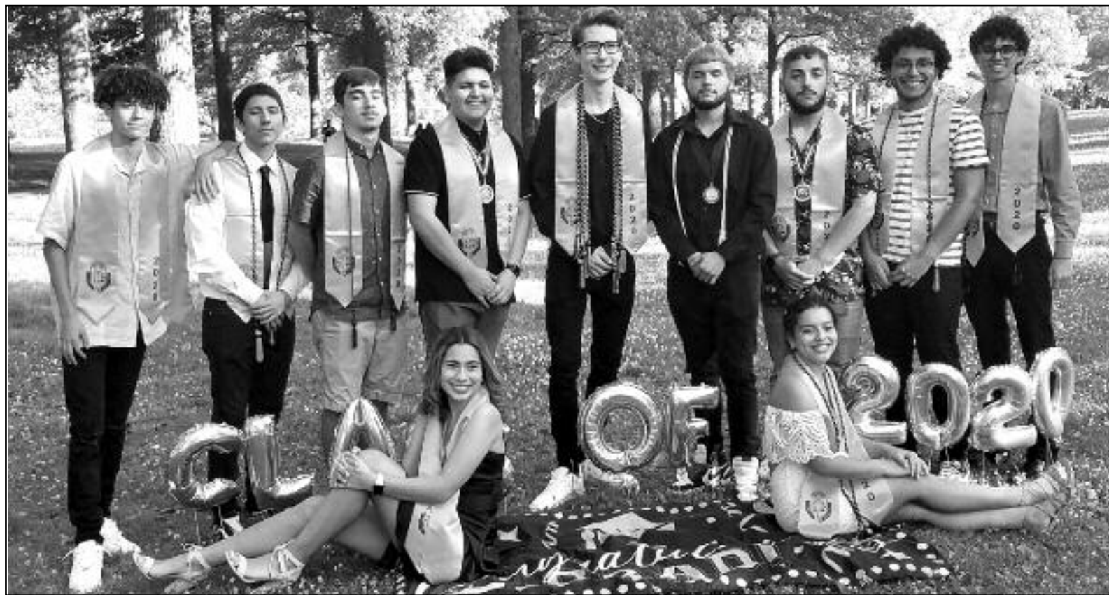
(above) Graduates and families submitted celebratory snapshots to be included in a virtual commencement ceremony.

Selling Your Home? Looking For Top Dollar? Call Your In Town Linden Specialist All Towne Realty