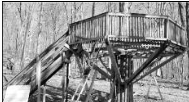
(above) The Dan Beard Tree House at Boy Scout Camp Somers received repairs by the Flintlocks over the winter.