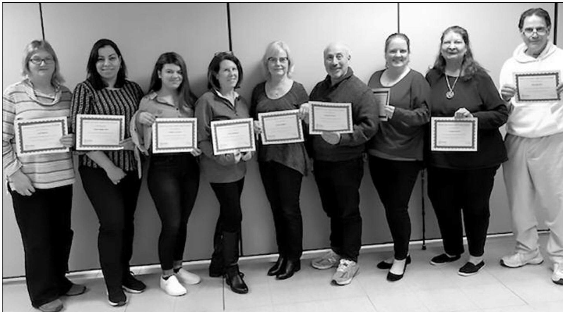
(above) Ten new volunteer tutors from Union County have completed their training and joined Literacy New Jersey as English as a Second Language tutors.

Literacy New Jersey runs tutor training twice a year, in January and September. The training provides a practical, hands on approach to working with adults, and includes ideas for materials and activities as well as strategies for lesson planning. Previous teaching experience is not required. For more information on training and other opportunities at Literacy New Jersey, please call 908-486-1777 or email bbagger@literacynj.org .