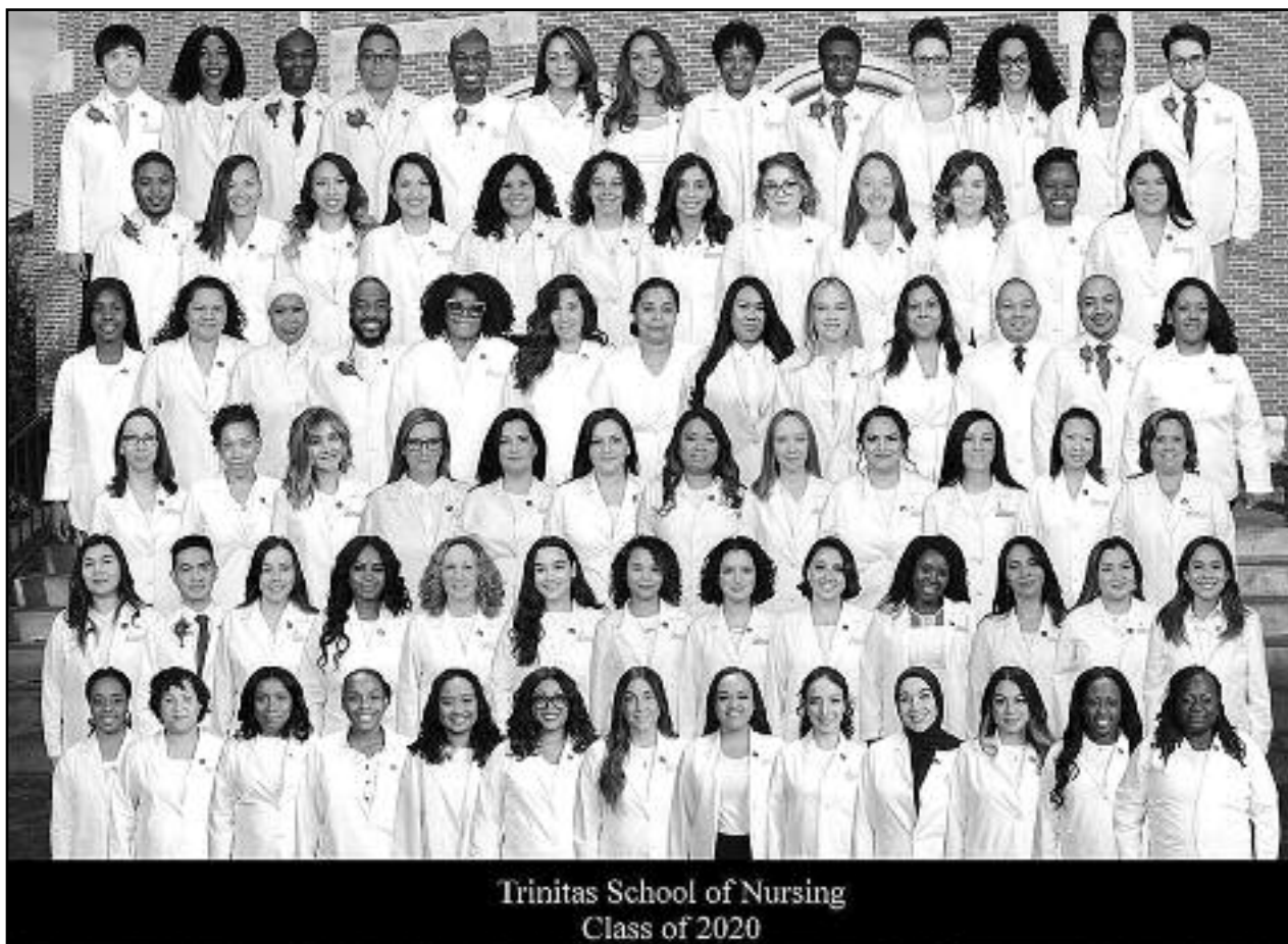
(above) Graduate photos were taken individually by Grace Photography

years 2015 - 2020 for Creating Environments that Enhance Student Learning and Professional Development. The School also holds a 20-year, 40-class national licensing examination (NCLEX) passage rate of 86.30% on first writing.