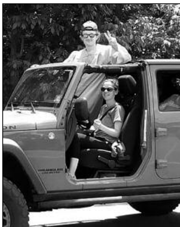
(above) Or another way to remember the say is to use the symbol for two levels of meaning: "Victory," sure, but also "Peace!"