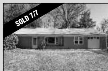
110 Mountain Pkwy Listed by Roseann