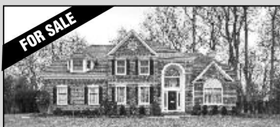
1 Bayview Terrace, Green Brook New kitchen and all hardwood floors 4 Beds / 3.1 Baths / $825,000

The recent health crisis has brought different challenges to all of us. You may have questions on how the local market is doing and how we are handling real estate transactions. I am happy to have a confidential conversation regarding your real estate needs. Call me anytime for a no-obligation chat or video call.