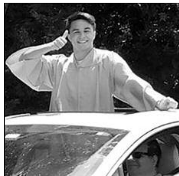
(above) What else is there to say, besides, "Thumbs Up!"