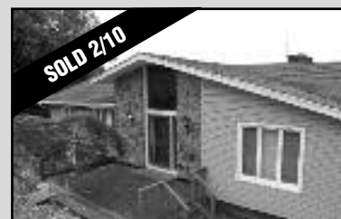
308 Warrentville Road Buyer agent Roseann