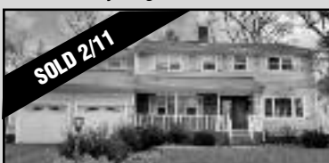
256 Greenbrook Road Buyer Agent Roseann