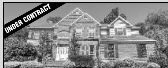
9 Ridge Road, Green Brook Meticulously appointed home in excellent neighborhood. 4 Beds / 3.1 Baths / $949,000