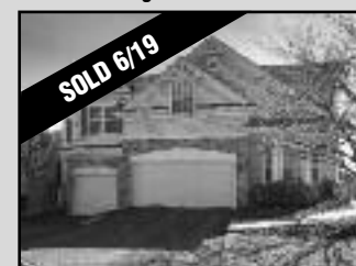
50 King George Rd Listed by Roseann