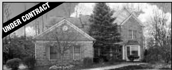
5 Warren Avenue, Green Brook Sprawling Colonial w/finished walk-out basement 4 Beds / 4.1 Baths / $850,000