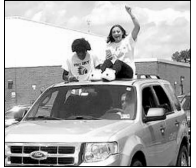
(above) For athletes, what else is there to say, besides, "Victory!"