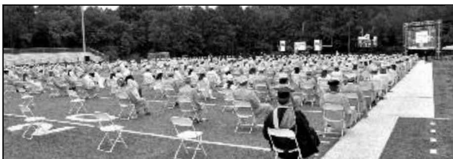
WHRHS, with the size of graduating seniors under 500, took full advantage of the 100 yards of its Stadium's artificial turf to seat the Class of 2020 with the required 6 feet between each student.

The Commencement was unofficially and effectively "Graduation Part II." On the day the Class of 2020 was originally scheduled to graduate before the COVID-19 Shutdown changed everything, Friday, June 19, the Class of 2020 participated in a Graduation Car Parade. That was the day a veritable sea of cars assembled in the Stirling Road-side parking lot in front of the WHRHS building. Beginning on about 11:45 a.m., Friday, June 19, the Car Parade ferried the Guests of Honor - the WHRHS Class of 2020 - in front of scores of applauding, cheering, encouraging teachers, staff and well-wishers. It took the better part of an hour for all the cars to complete the parade's route through campus. The participating students, often accompanied in their cars by parents, siblings, other relations and even for some with family pets. Everyone appeared to genuinely enjoy the opportunity to get together as a class for the first time since March.