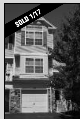
1096 Shadowlawn Drive Listed by Roseann