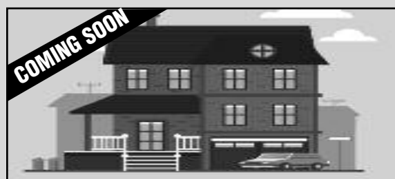
In Top of the World, Green Brook Meticulously updated colonial w/ in-law suite 6 Beds / 4.1 Baths / 3 Car Garage