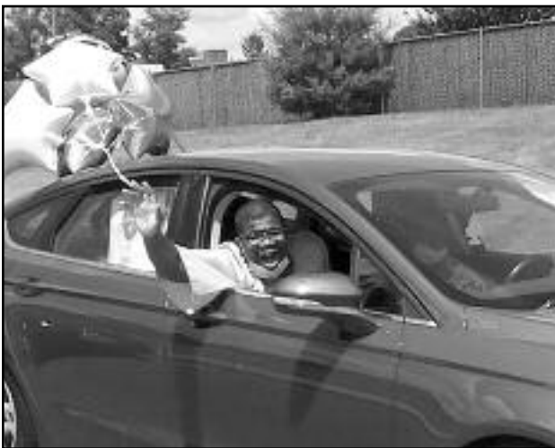
(above) So many Class of 2020 graduates were beaming from their cars as they passed well-wishers, they seemed to be saying they were ready to reach for the stars.