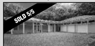
222 Greenbrook Road Listed by Roseann