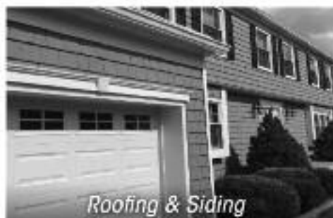
Roofing & Siding