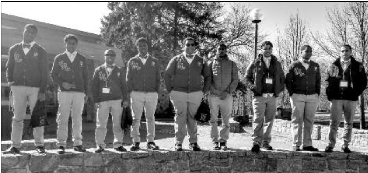
(above) At the 2020 Northeastern Province Kappa League Leadership Conference, participants learned leadership skills and attended seminars in academic excellence, STEM/digital literacy and coding, dining/grooming etiquette, health and wellness, financial literacy, mental health, and police relations.