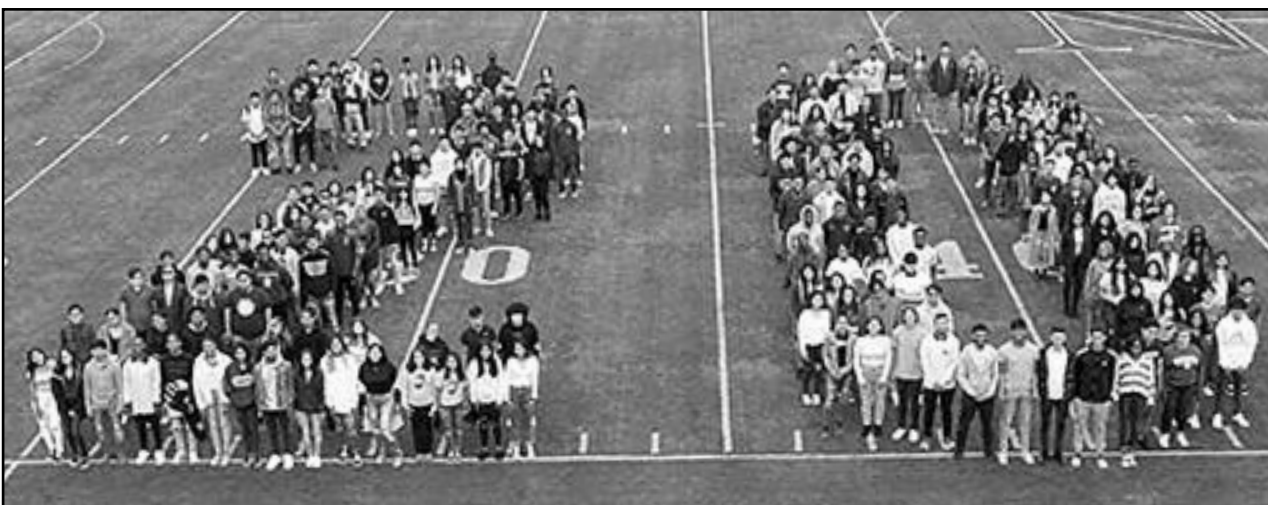
(above) North Plainfield High School class of 2020 gathered for a group photo in October 2019 on the NPHS football field.