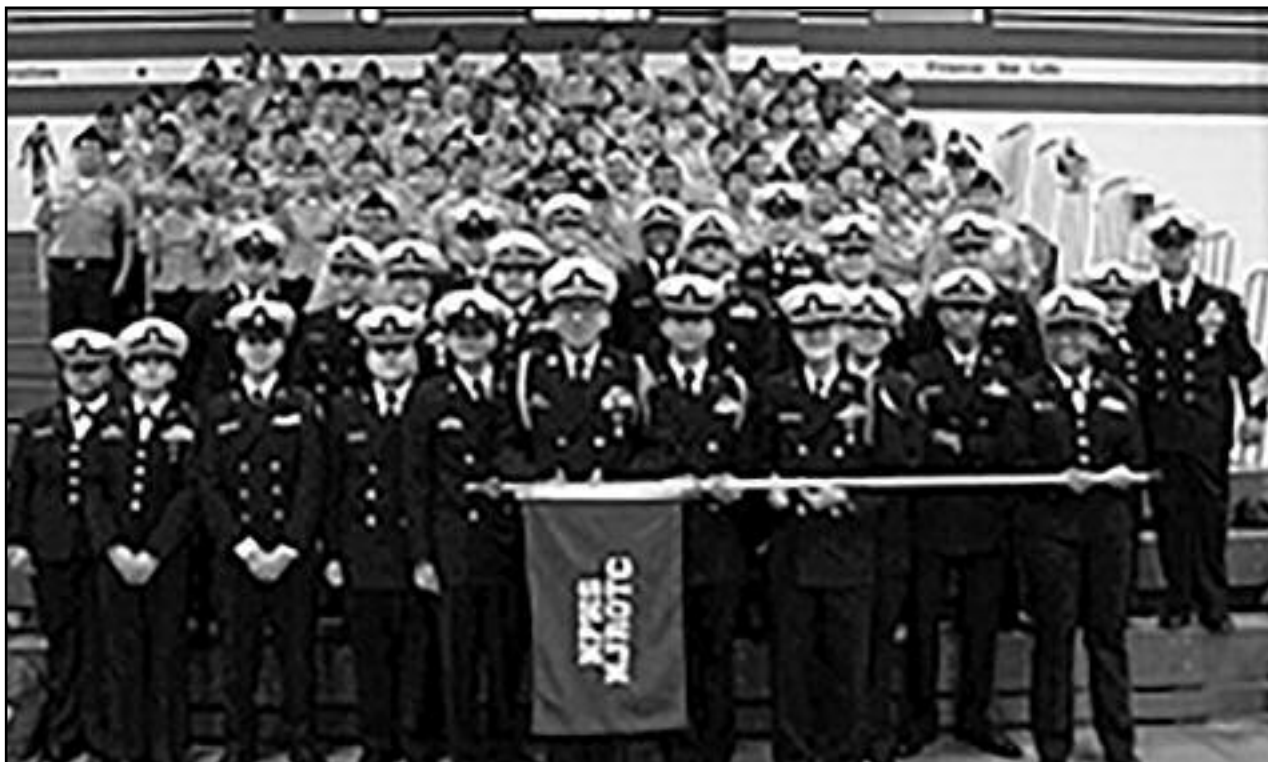
(above) North Plainfield High School's NJROTC Annual Military Inspection 2020

As for the graduating class of 2020, many of these cadets are unable to experience the highly anticipated JROTC events such as the Navy Ball. Thankfully, this upcoming school year current cadets and returning officers that have graduated are still able to experience another Navy Ball, as they are highly encouraged to attend!