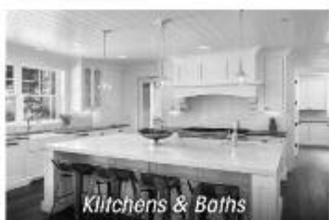
Kitchens & Baths