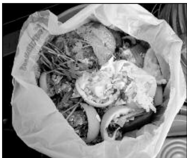
(above) Example of a compost bucket

To learn more about home composting, visit epa.gov/recycle/composting-home or the Rutgers Agricultural Experiment Station website. For questions, you can also email the Madison Environmental Commission at mec@rosenet.org .