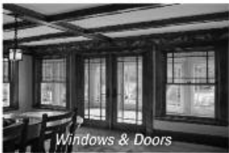
Windows & Doors