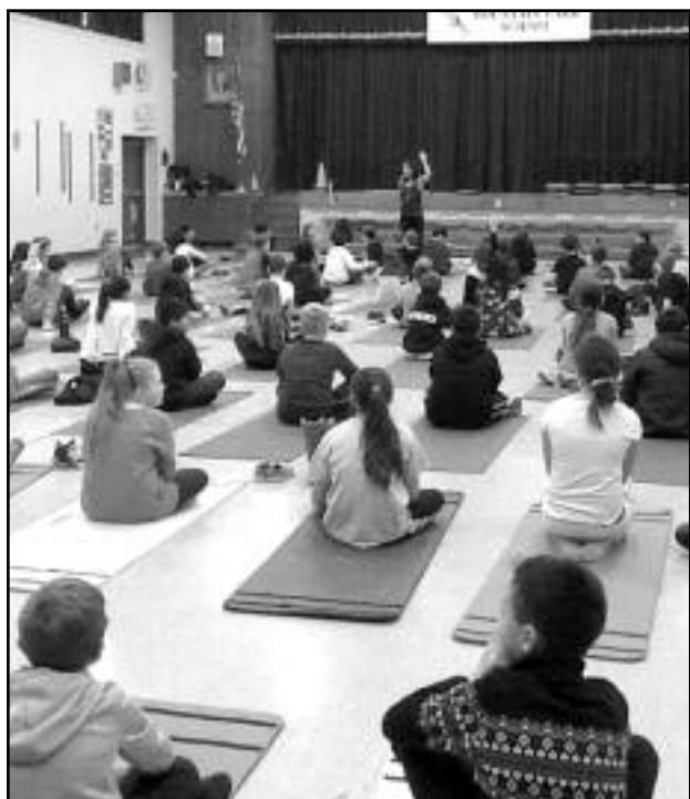
(above) Students at Mountain Park School practice yoga during a special assembly program.

Thanks again to the Mountain Park School PTO and Cultural Arts Committee for sponsoring this amazing assembly!