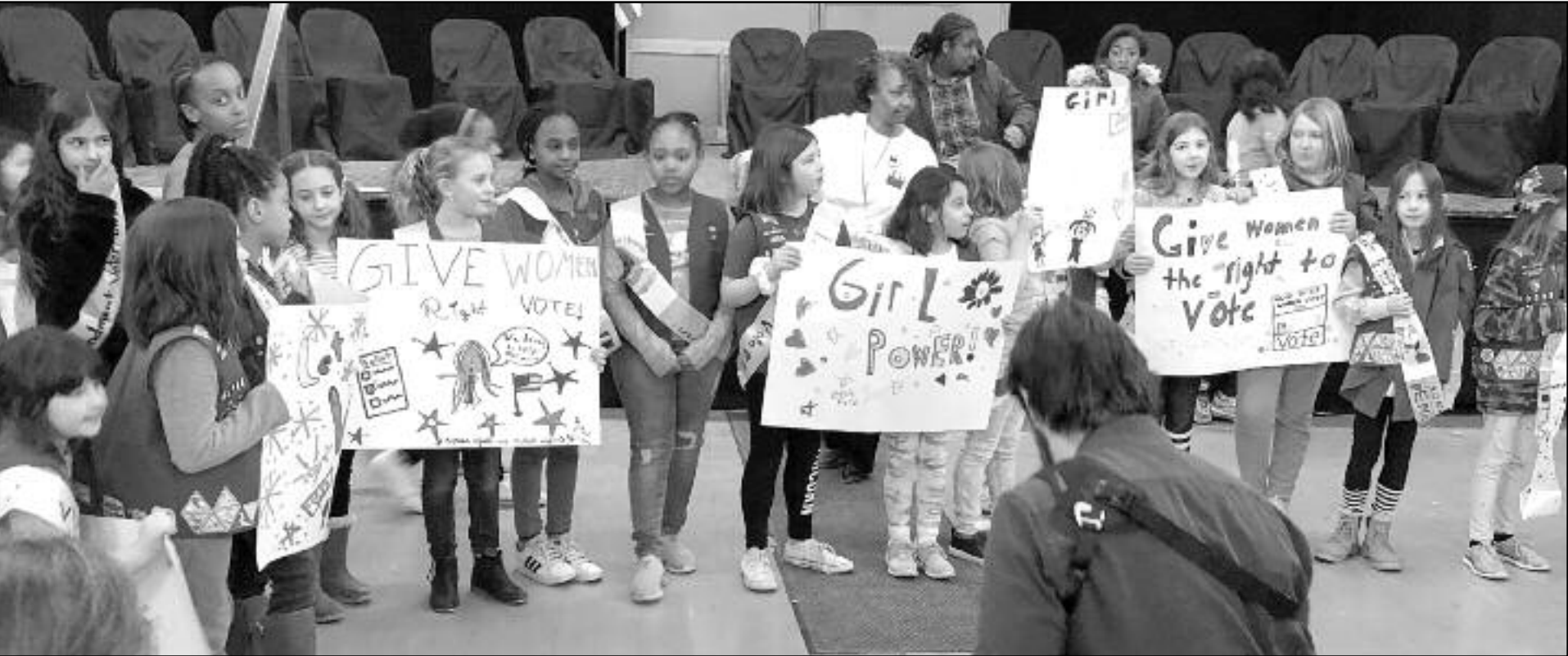
(above) Girls Scouts earned badges, met local elected officials, and learned about civic engagement and advocacy.