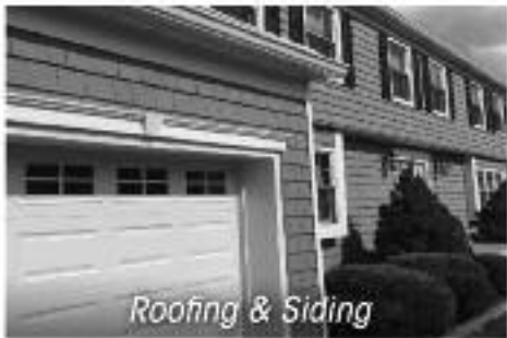
Roofing & Siding