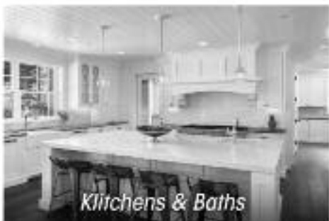
Kitchens & Baths