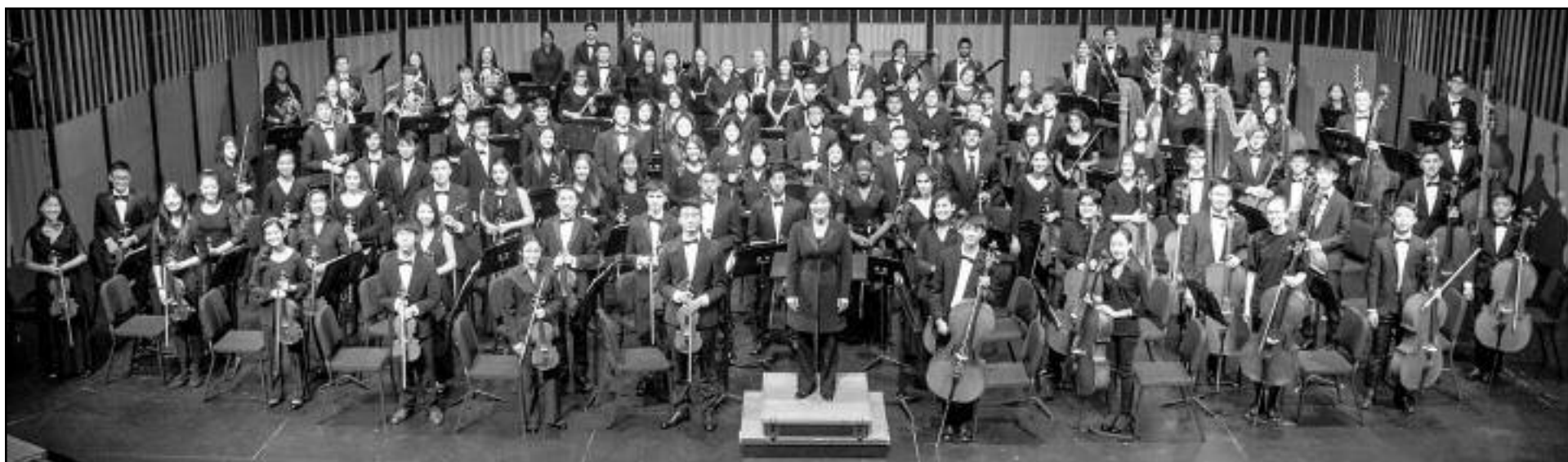
(above) Audition registration for New Jersey Youth Symphony's 15 ensembles is available online now through May 10.

The New Jersey Youth Symphony is a program of the Wharton Institute for the Performing Arts. Wharton is New Jersey's largest non-profit performing arts education organization serving over 1,500 students of all ages and abilities through a range of classes and ensembles. In addition to the New Jersey Youth Symphony, programs include the Paterson Music Project and Performing Arts School.