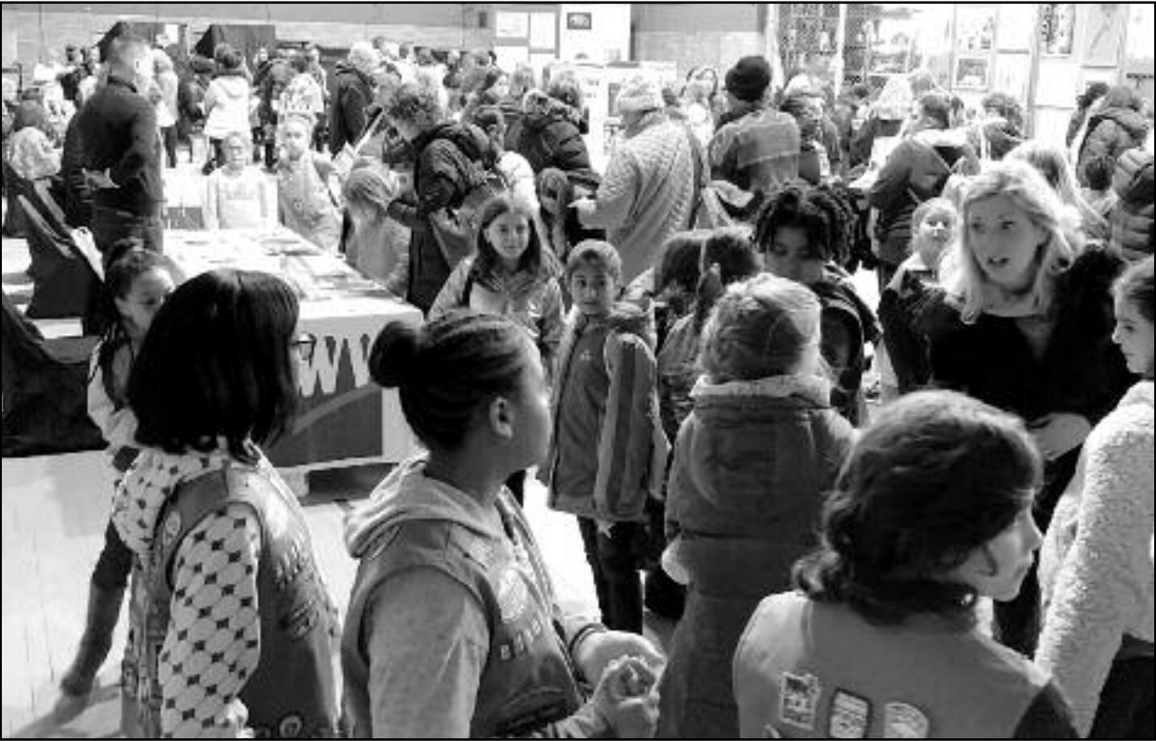
(above) Over 500 Girl Scouts participated in “Voter Girl”, presented in partnership with the League of Women Voters.

This was a wonderful opportunity for girls and women of all ages to see women who are actively engaged in making democracy work. This coincided with the 100th Anniversary of both the League of Women Voters and the passage of the 19th Amendment.