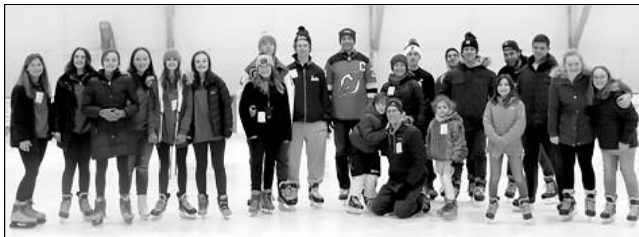
(above) Local teenagers organized “Skating For Smiles,” an event to raise funds and build local awareness about Operation Smile.