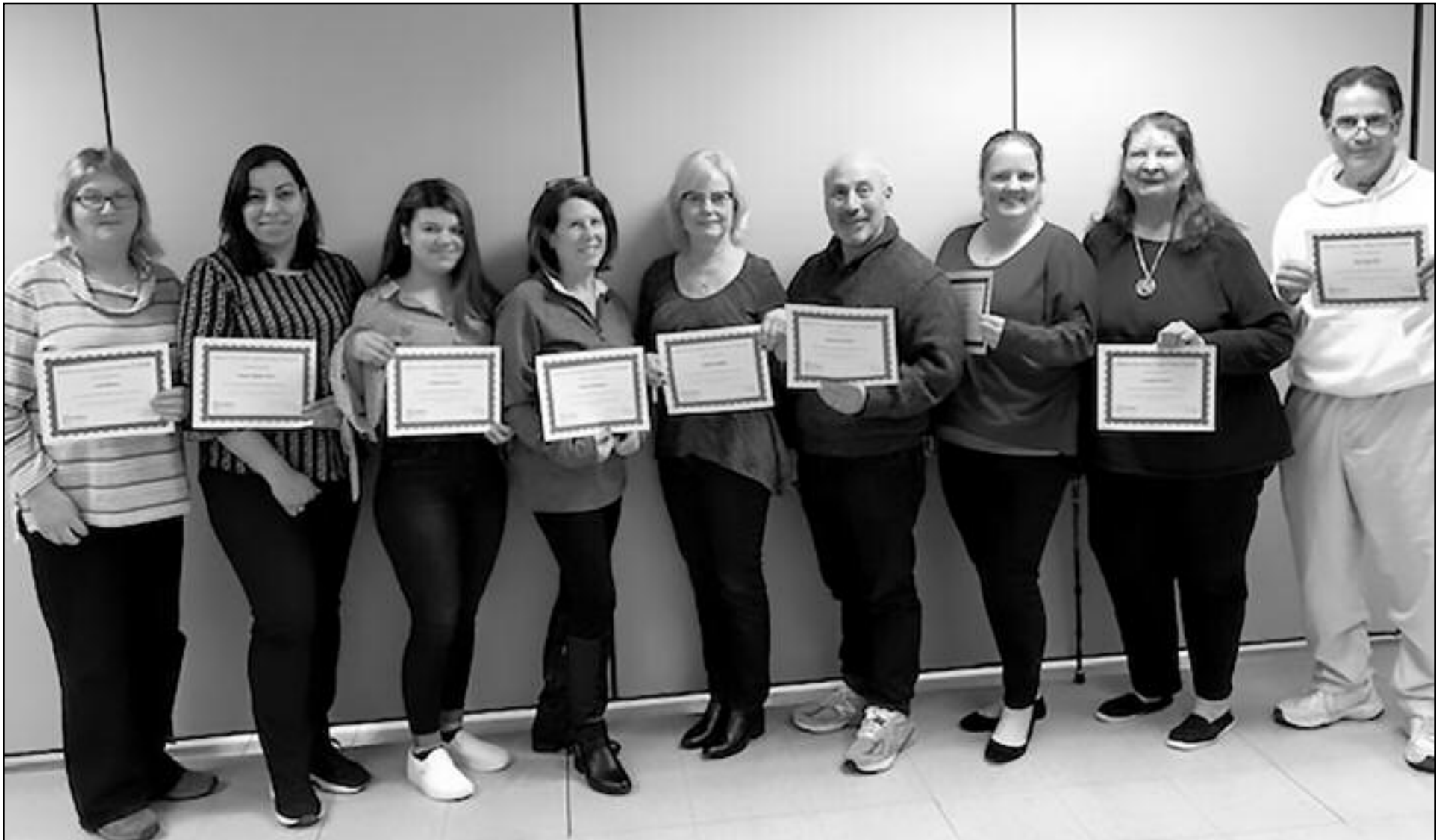
(above) Ten new volunteer tutors from Union County have completed their training and joined Literacy New Jersey as English as a Second Language tutors.

For more information on training and other opportunities at Literacy New Jersey, please call 908-486-1777 or email bbagger@literacynj.org .