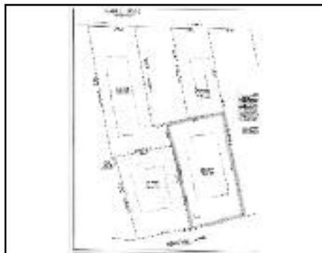
3 Heritage Lane, Scotch Plains Offered at $650,000