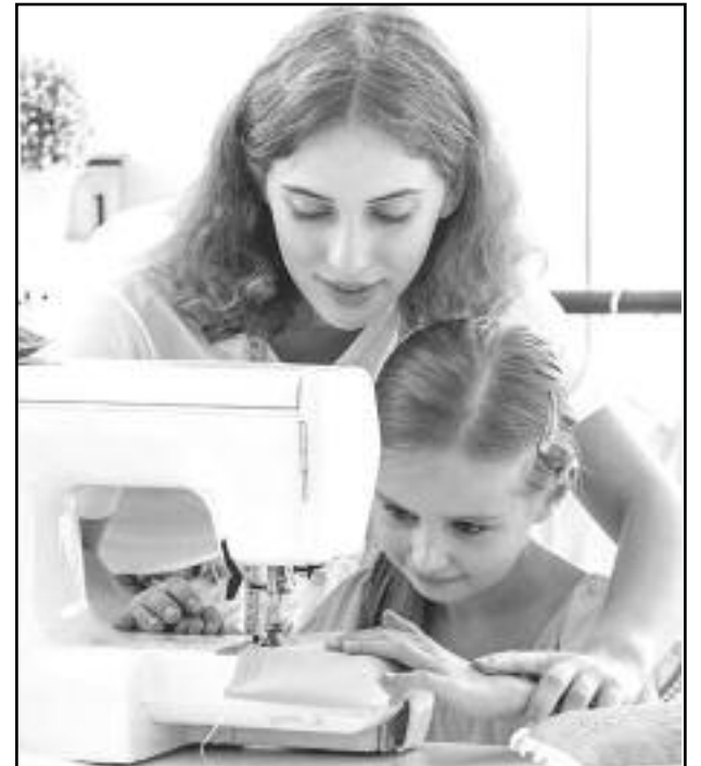
(above) AfriCrafts fabric activity kits feature supplies for fun and easy projects for kids – Call Cultured Expressions.866-683-2568 or email info@CulturedExpressions.com.