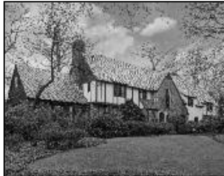
10 Kimball Circle, Westfield Offered at $2,250,000