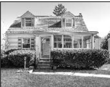
123 Burnside Avenue, Cranford Offered at $399,900