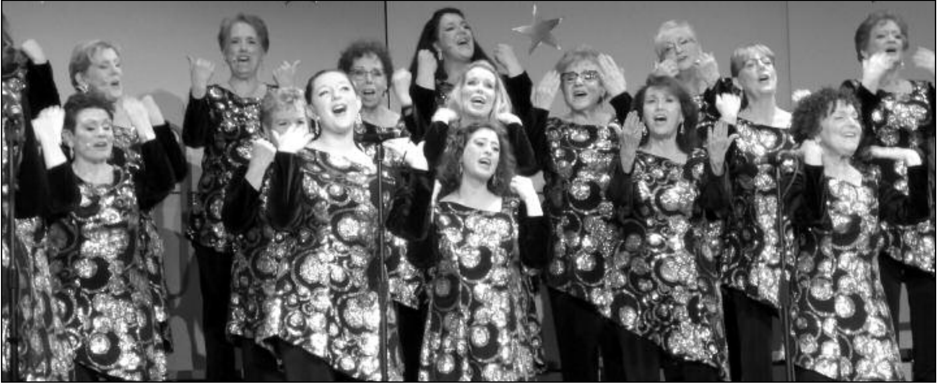
(above) The Hickory Tree Chorus, a chapter of Sweet Adelines International, is now accepting applications for their annual $1,000 music scholarship.

Details and applications are available on the chorus web site at hickorytreechorus.org .