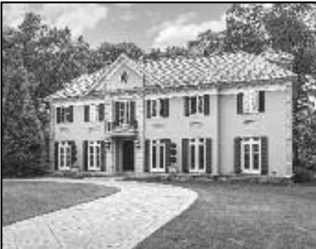
102 Golf Edge, Westfield Offered at $2,450,000