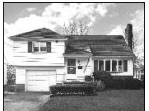
6 Blake Avenue, Cranford Offered at $450,000