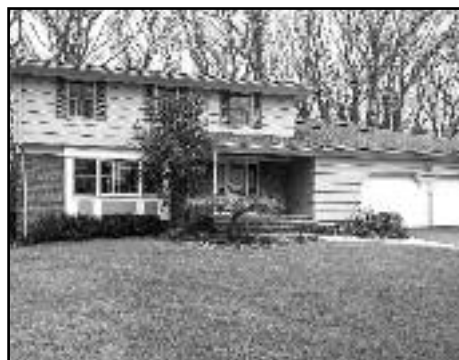
820 Cranford Avenue, Westfield Offered at $899,900