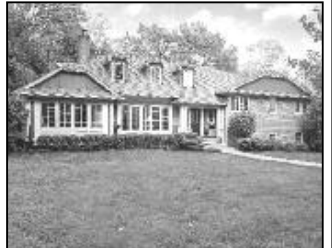
820 Lawrence Avenue, Westfield Offered at $1,550,000