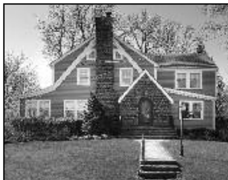
701 Coleman Place, Westfield Offered at $1,050,000