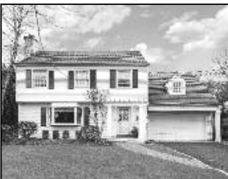
849 Bradford Avenue, Westfield Offered at $899,900