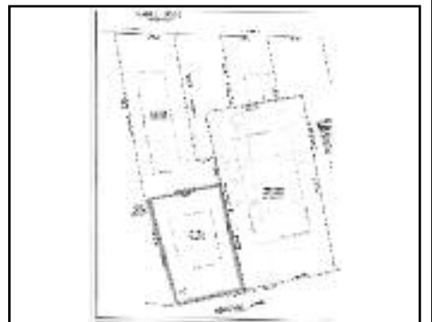
5 Heritage Lane, Scotch Plains Offered at $550,000