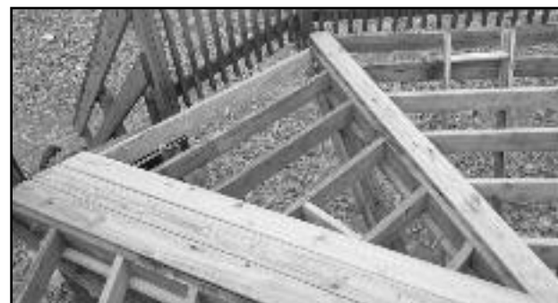
(above) The Dan Beard Tree House at Boy Scout Camp Somers received repairs by the Flintlocks over the winter.