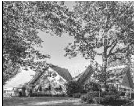
950 Minisink Way, Westfield Offered at $2,000,000