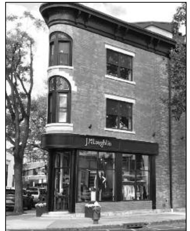
(above) Westfield's Flatiron Building was the recipient of a 2019 Devlin Award from the Historic Preservation Commission for outstanding renovation of a commercial property. Nominations are currently being sought for the 2020 awards.