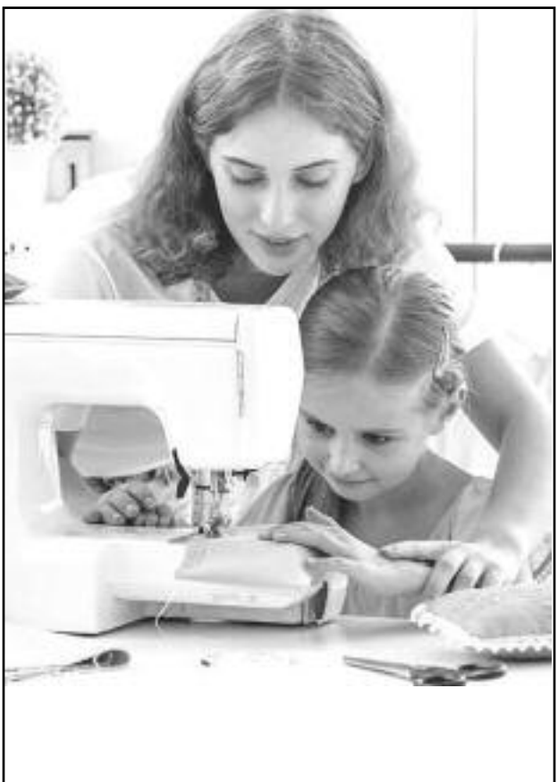
(above) AfriCrafts fabric activity kits feature supplies for fun and easy projects for kids – Call Cultured Expressions.866-683-2568 or email info@CulturedExpressions.com.