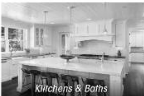
Kitchens & Baths