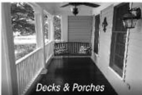
Decks & Porches