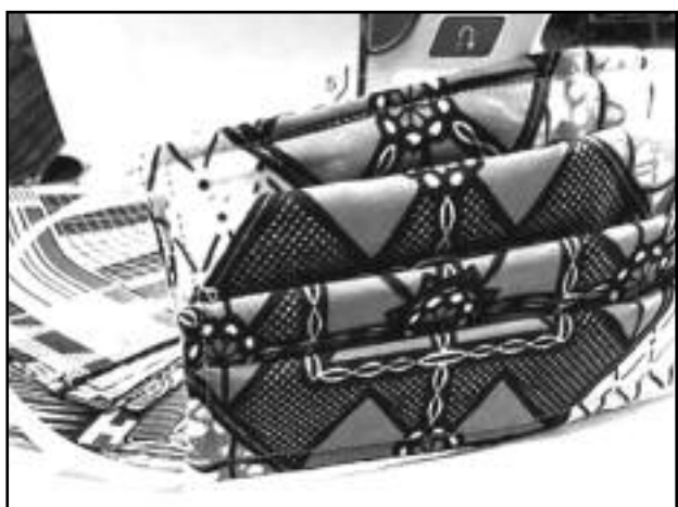
(above) Sewers and quilters interested in making their own fabric face masks will also find CE's FREE face mask video tutorial on Instagram @culturedexpressions.