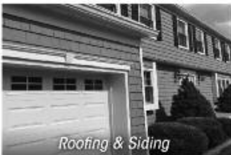
Roofing & Siding