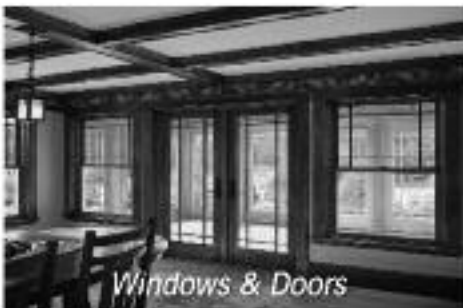
Windows & Doors