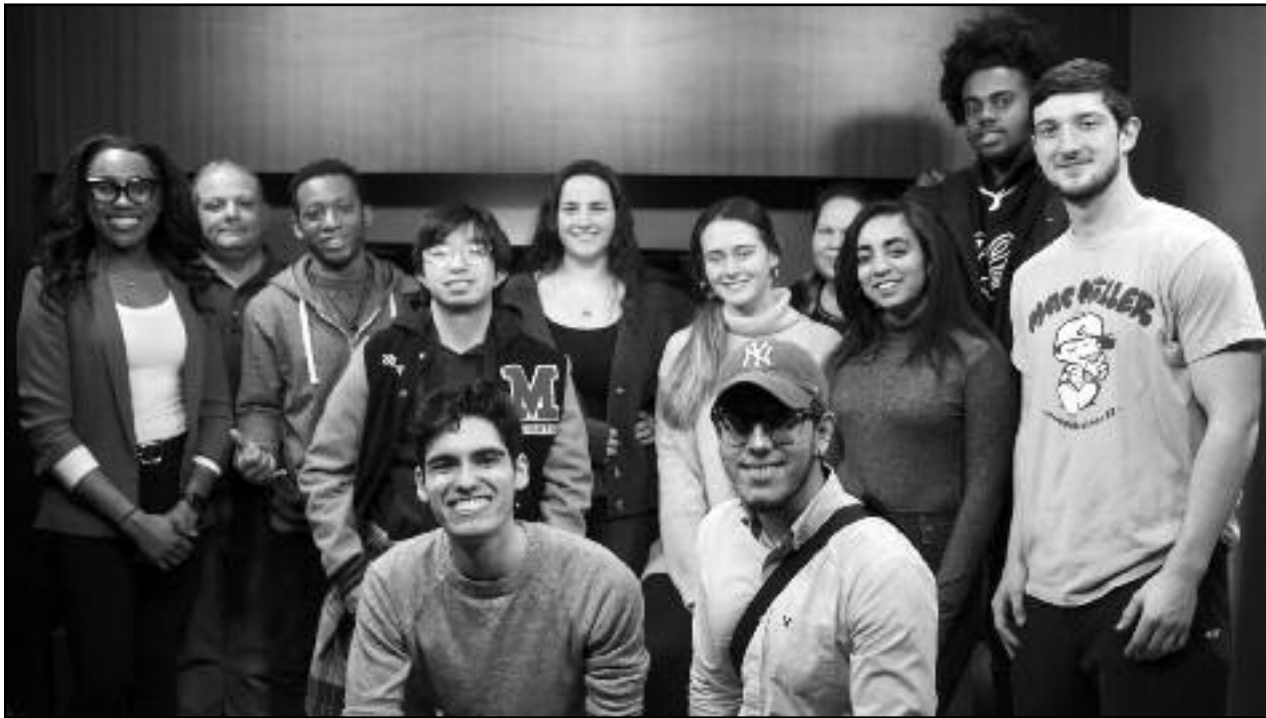
(above) Kean University students, part of KeanTV, stopped by the UnionTV34 studio and control room for a two hour tour with their professor.