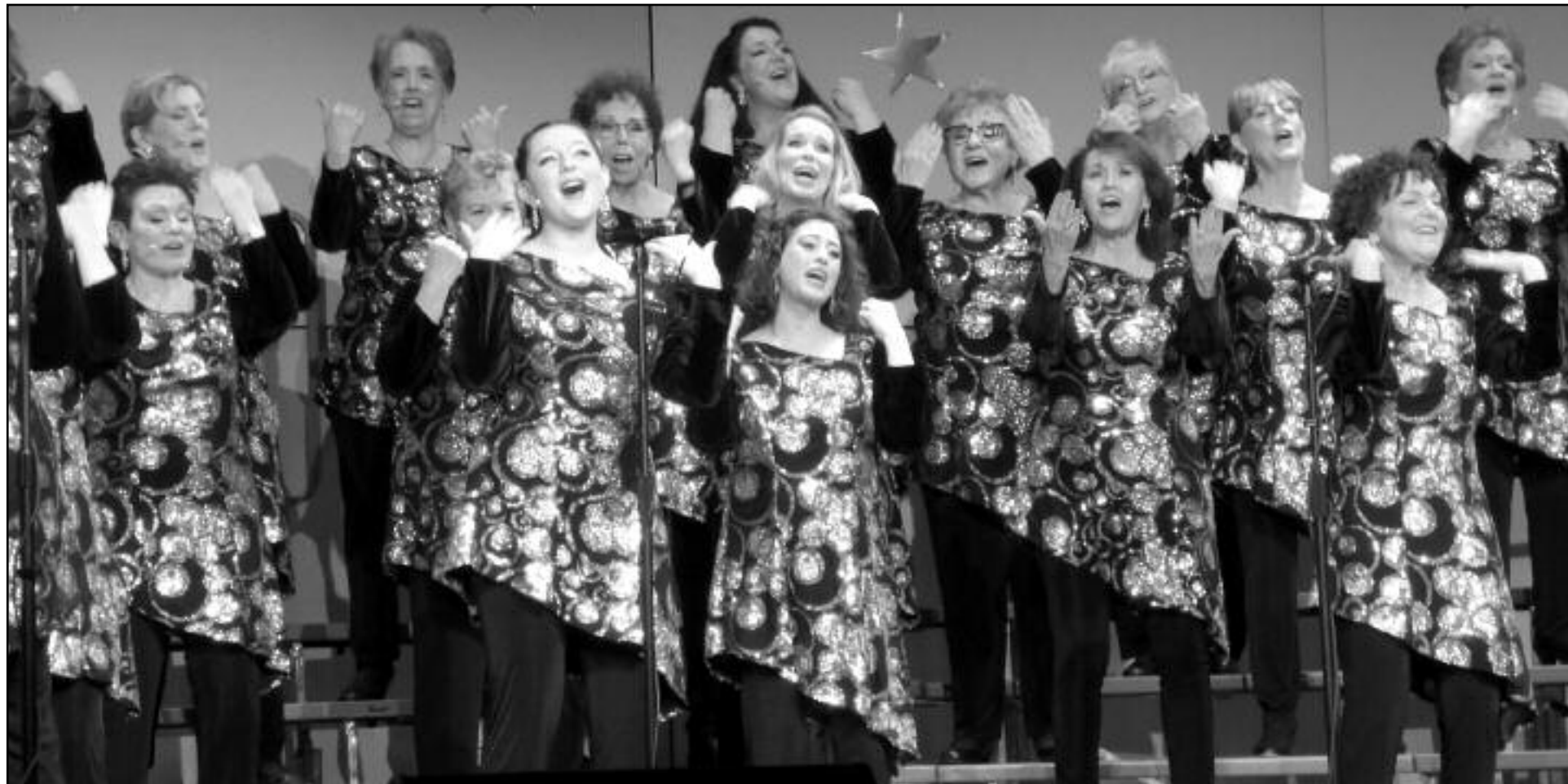
(above) The Hickory Tree Chorus, a chapter of Sweet Adelines International, is now accepting applications for their annual $1,000 music scholarship.

Details and applications are available on the chorus web site at hickorytreechorus.org .