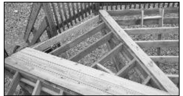
(above) The Dan Beard Tree House at Boy Scout Camp Somers received repairs by the Flintlocks over the winter.