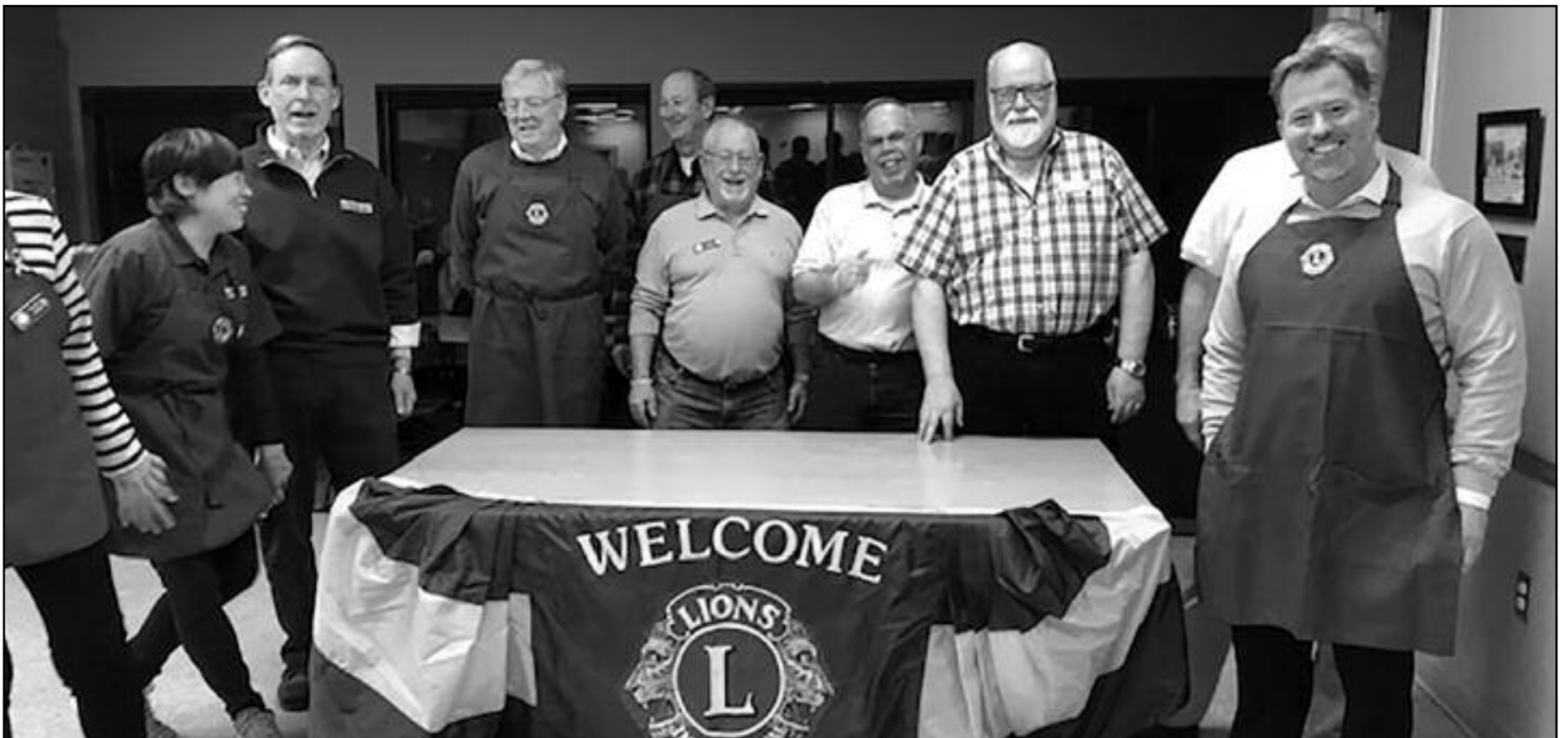
(above) Community Service Association of New Providence Annual Pasta Dinner, hosted by the CSA and NP Lions, was held on March 1st.

To Donate: Mail check to NP Lions Club, PO Box 854, New Providence, NJ 07974 For more information/membership please e mail info@nplions.org or visit www.nplions.org .