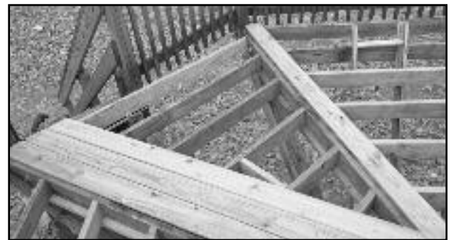
(above) The Dan Beard Tree House at Boy Scout Camp Somers received repairs by the Flintlocks over the winter.