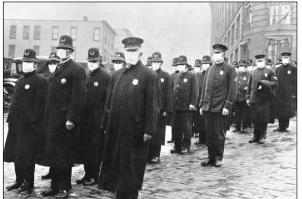
(above) Police in an American city clad in face masks.