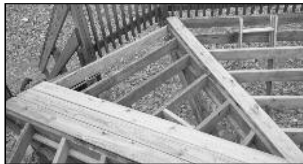
(above) The Dan Beard Tree House at Boy Scout Camp Somers received repairs by the Flintlocks over the winter.