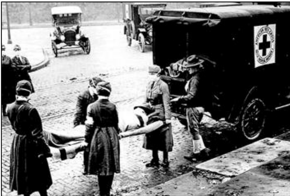
(above) Red Cross workers ease a victim into an ambulance.

Photo credit: 1957 Historic Signs, 1930s Historic Signs, 1928 Historic Signs, 1960s Historic Signs, 2005 Historic Signs.