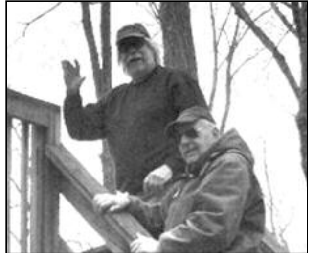
(above) The Dan Beard Tree House at Boy Scout Camp Somers received repairs by the Flintlocks over the winter.