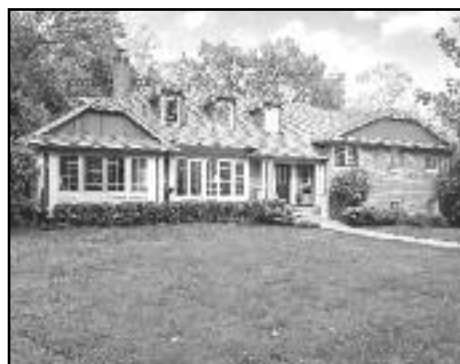
820 Lawrence Avenue, Westfield Offered at $1,550,000