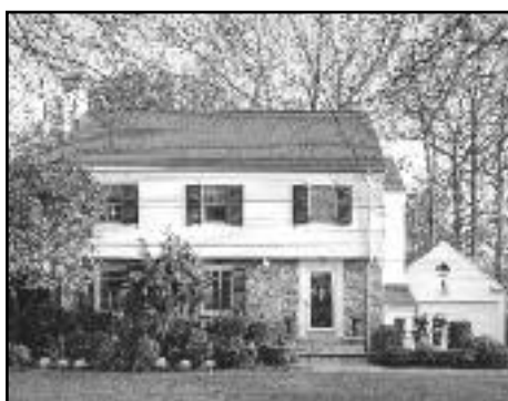
725 Shadowlawn Drive, Westfield Offered at $1,095,000