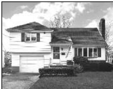
6 Blake Avenue, Cranford Offered at $450,000