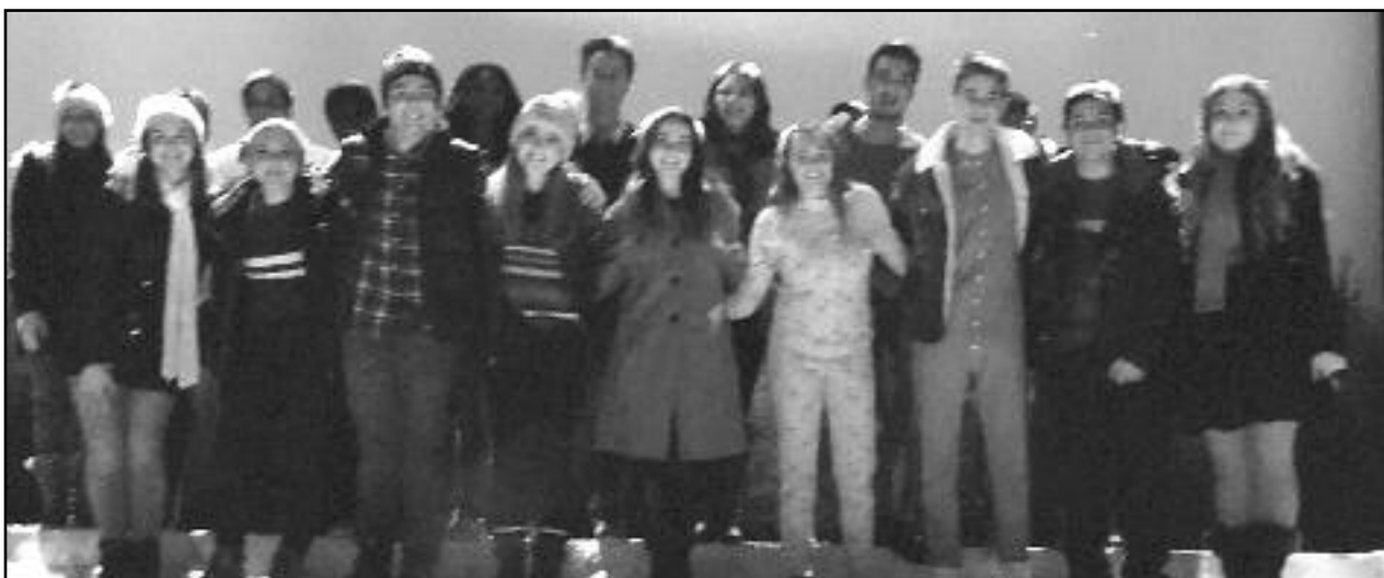
(above) The cast of WHRHS fall performance of “Almost, Maine”

GUEST SPEAKERS, TRIPS, AND FUN PARTIES ARE PLANNED THROUGHOUT THE YEAR.