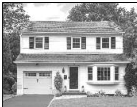
710 Girard Avenue, Westfield Offered at $765,000