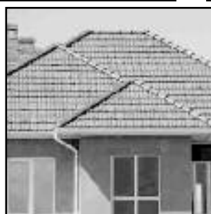
SPANISH STYLE ROOF