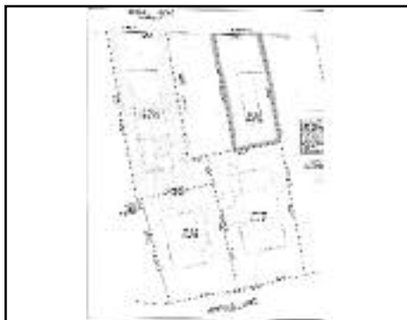
1410 Terrill Road, Scotch Plains Offered at $450,000