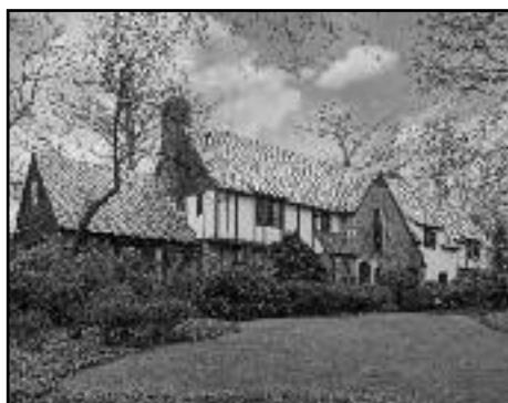
10 Kimball Circle, Westfield Offered at $2,500,000