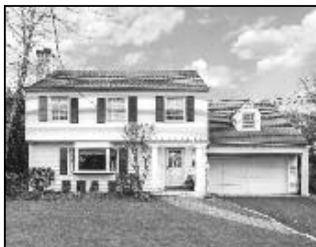
849 Bradford Avenue, Westfield Offered at $899,900