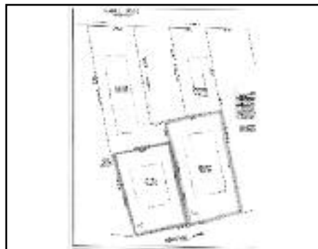
3 & 5 Heritage Lane, Scotch Plains Offered at $650,000 & $550,000