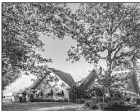
950 Minisink Way, Westfield Offered at $2,100,000