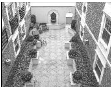
111 Prospect Street 3D, Westfield Offered at $774,900