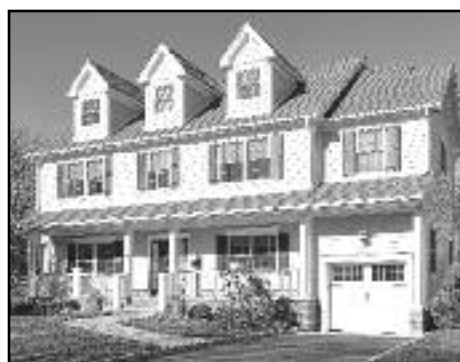
233 Elizabeth Avenue, Westfield Offered at $1,095,000