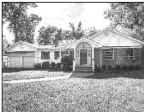
351 Raccoon Hollow, Mountainside Offered at $549,000