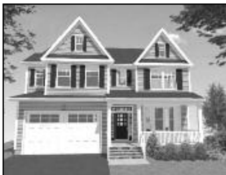
111 Ayliffe Avenue, Westfield Offered at $999,900