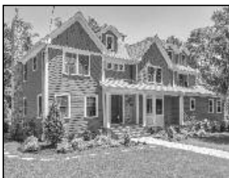
110 Wychwood Road, Westfield Offered at $1,395,000