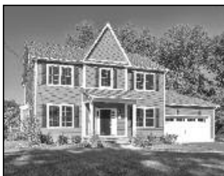
1115 Summit Avenue, Westfield Offered at $1,245,000