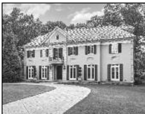
102 Golf Edge, Westfield Offered at $2,750,000