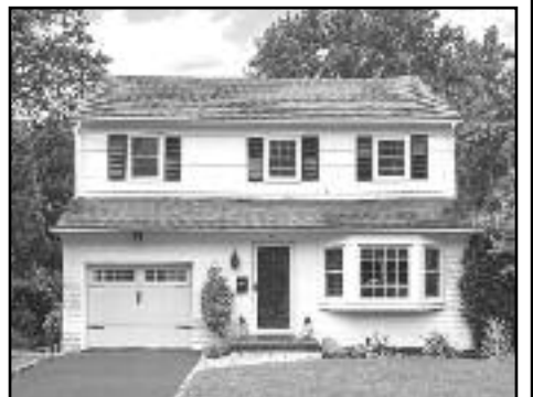
710 Girard Avenue, Westfield Offered at $765,000