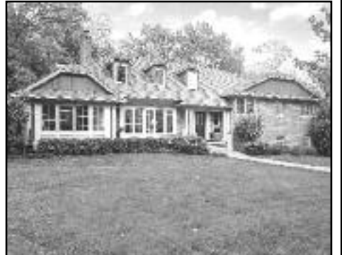
820 Lawrence Avenue, Westfield Offered at $1,550,000