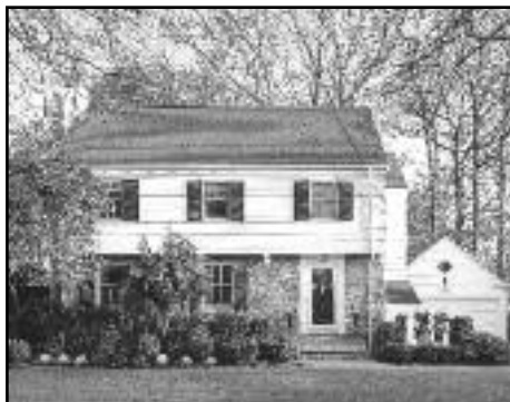
725 Shadowlawn Drive, Westfield Offered at $1,095,000