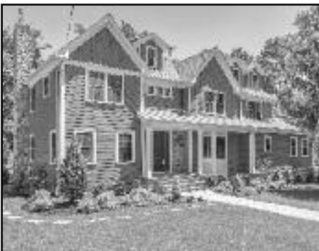
110 Wychwood Road, Westfield Offered at $1,395,000