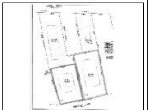
3 & 5 Heritage Lane, Scotch Plains Offered at $650,000 & $550,000