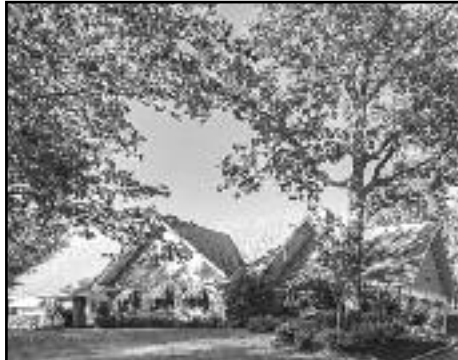
950 Minisink Way, Westfield Offered at $2,100,000