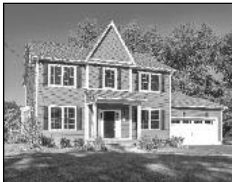
1115 Summit Avenue, Westfield Offered at $1,245,000