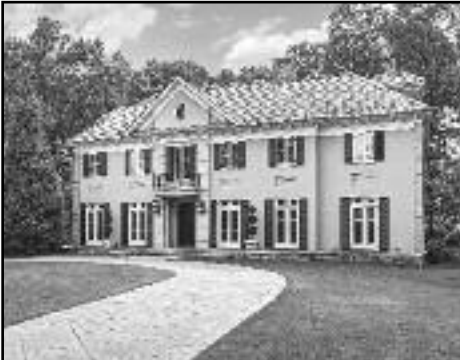
102 Golf Edge, Westfield Offered at $2,750,000