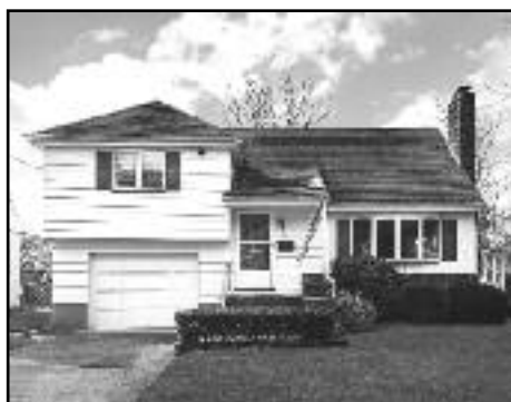
6 Blake Avenue, Cranford Offered at $450,000