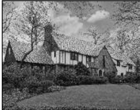
10 Kimball Circle, Westfield Offered at $2,500,000