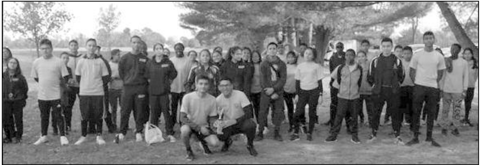
(above) The North Plainfield NJROTC cadets won third place for Orienteering.