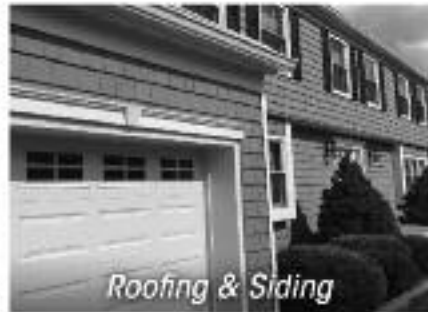
Roofing & Siding