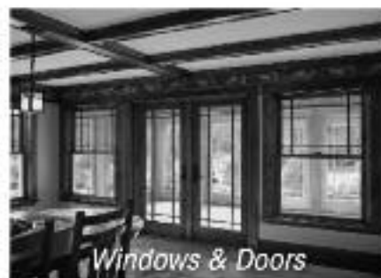
Windows & Doors