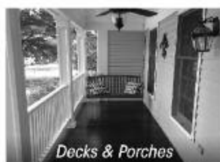
Decks & Porches