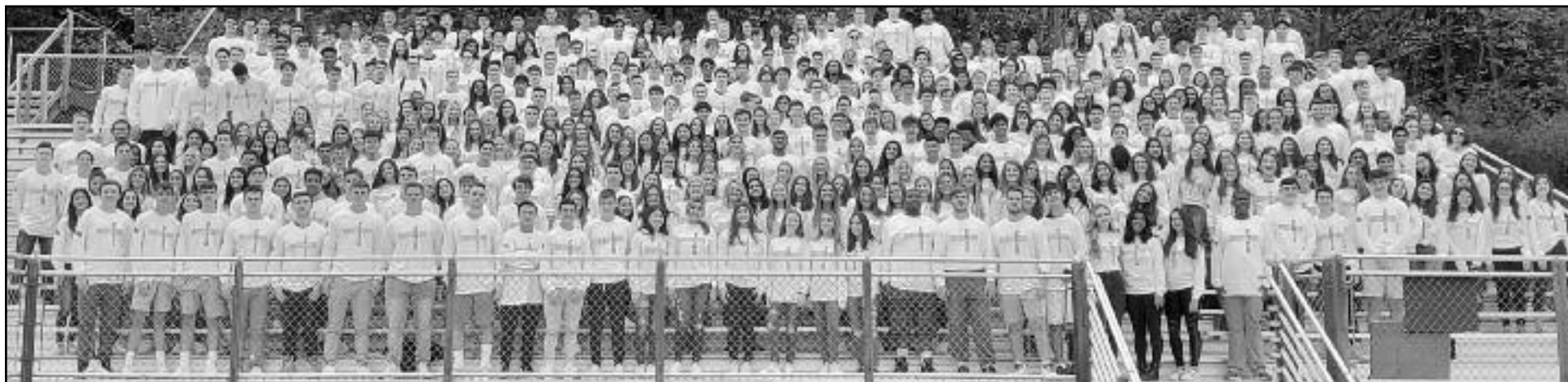
(above) The Class of 2020 on their Senior shirts.