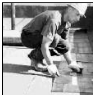
FLAT TOP ROOF