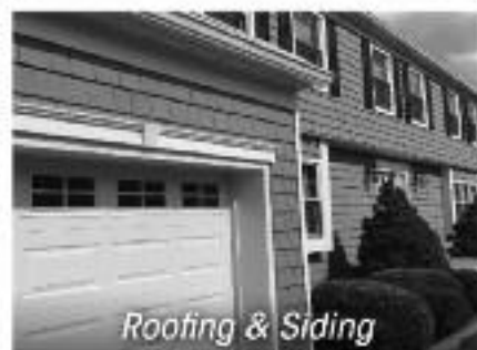
Roofing & Siding