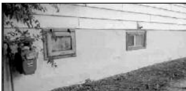
FOUNDATION REPAIRS BEFORE & AFTER