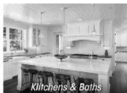
Kitchens & Baths