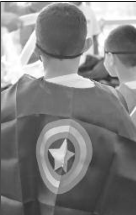
(above) The adoptees, each wearing superhero capes, ready to pose for a picture with their favorite superheroes.