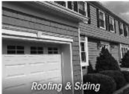
Roofing & Siding