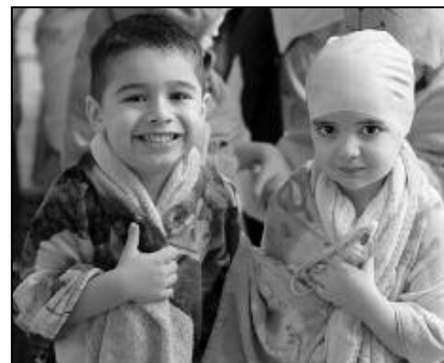
(above) Check out your local YMCA's upcoming programs and offerings.