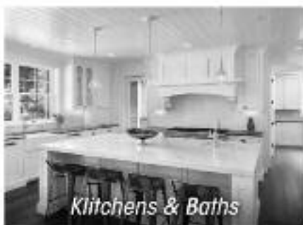
Kitchens & Baths