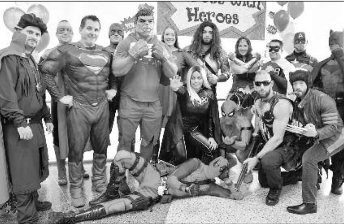
(above) The Heroes4Heroes group, a nonprofit comprised of corrections officers who dress as superheroes and visit children.

For details on CASA of Union County and becoming an advocate for a foster youth, reach Courtney at 908-293-8136 or log on to casaofunioncounty.org to learn more.