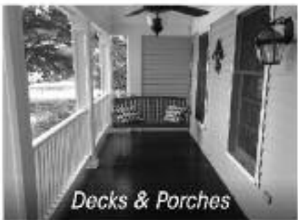
Decks & Porches