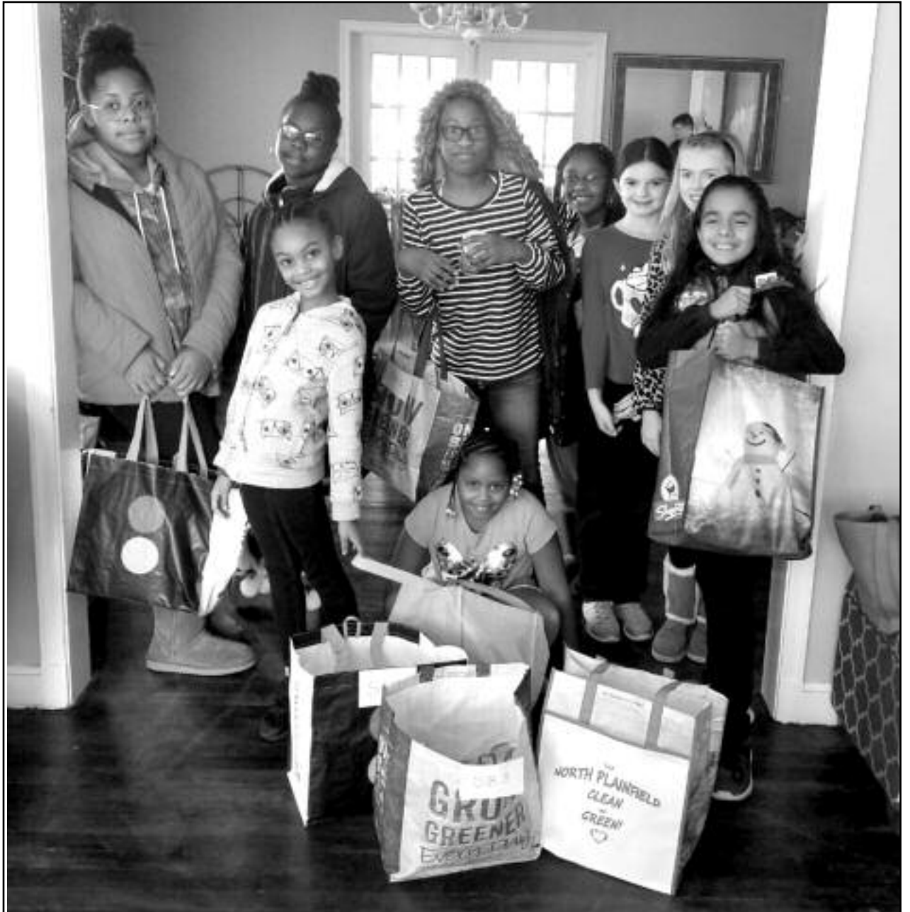
(above) Members of North Plainfield Girl Scouts Troop 65141