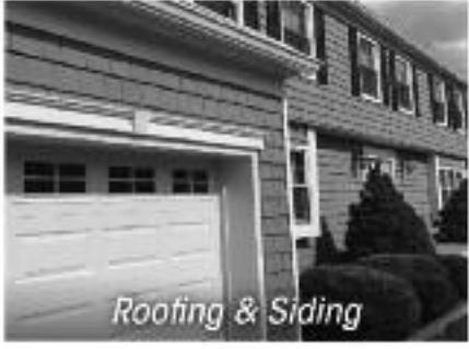
Roofing & Siding