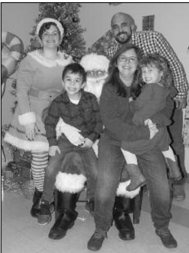
(above) The Tree lighting ceremony was produced by the North Plainfield Recreation Committee. The event featured the Washington Park Singers singing Christmas Carols. Unity Bank brought Frosty the Snow man and handed out soccer balls