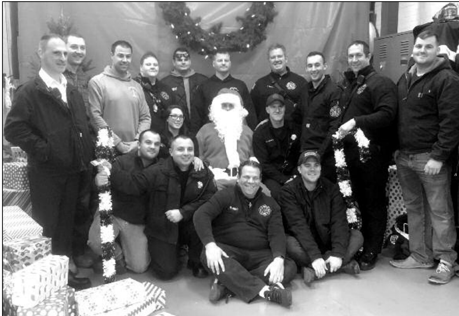
(above) Firefighters and EMTs planned and coordinated for Santa to visit the firehouse on December 8th, 2019.