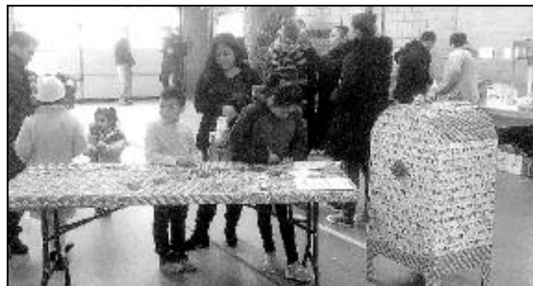
(above) Children who visited the firehouse were able to meet with Santa, and write and mail a letter to him at a letter writing station.

The Firefighters and EMTs also planned and coordinated for Santa to visit the firehouse on December 8th. Well over 200 visitors (mostly children) came through the firehouse for the opportunity to see Santa, draft a letter to him at a letter writing station, and get their picture taken with him. Local vendors Costco, Wawa, Texas Roadhouse, and Quick Check also helped make this event very successful.