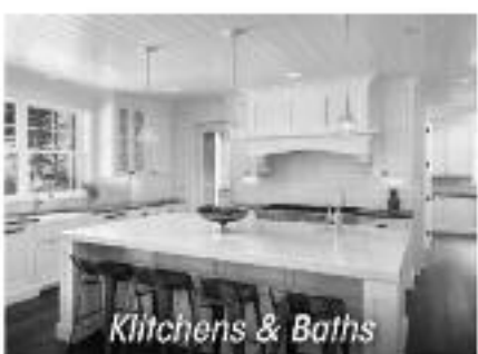
Kitchens & Baths