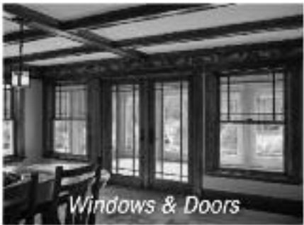
Windows & Doors