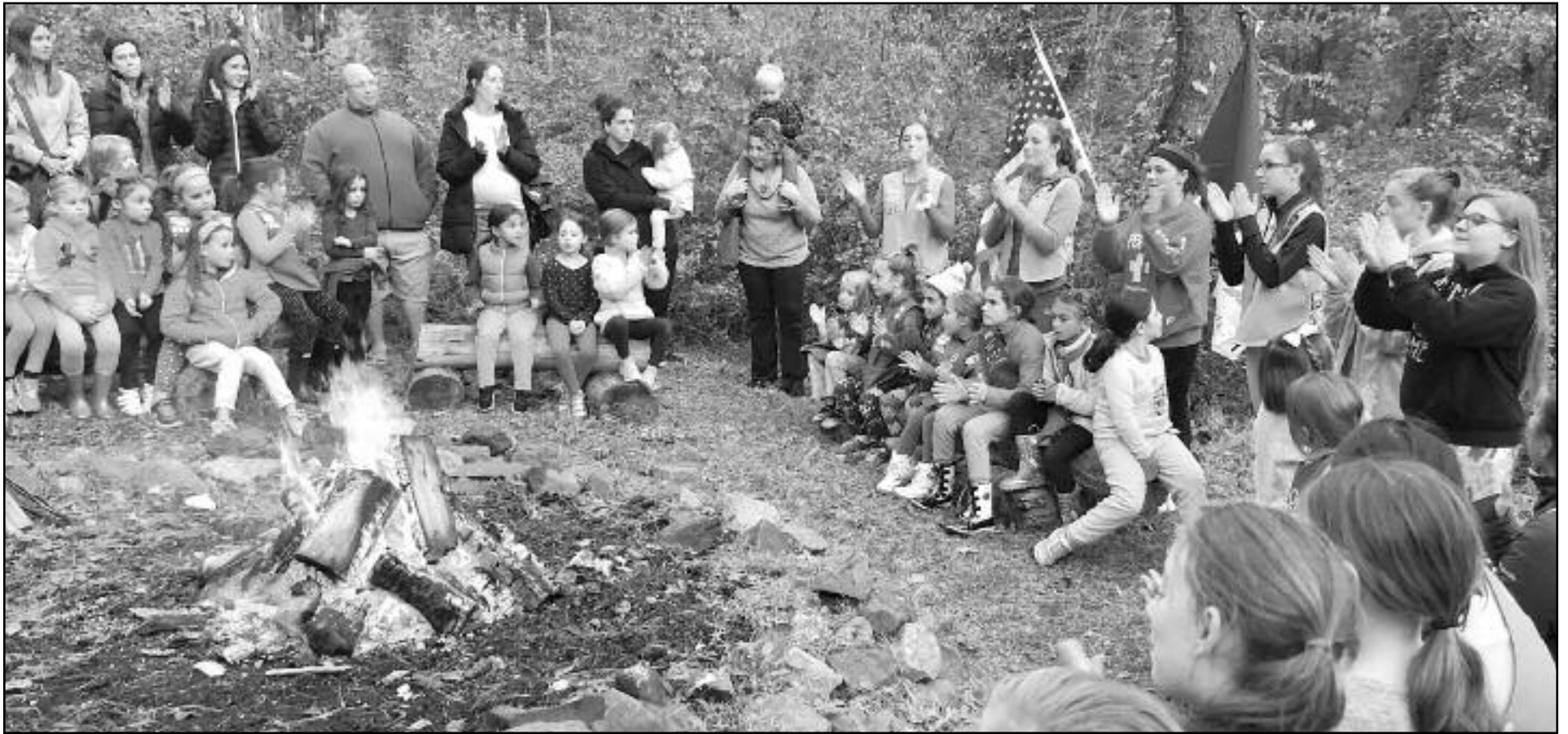
(above) Long Hill Township's Girl Scouts gathered around a camp fire for a Sing-Along.

A big thank you to Lombardo Farms for their donation of the firewood. It was a fun time for all.