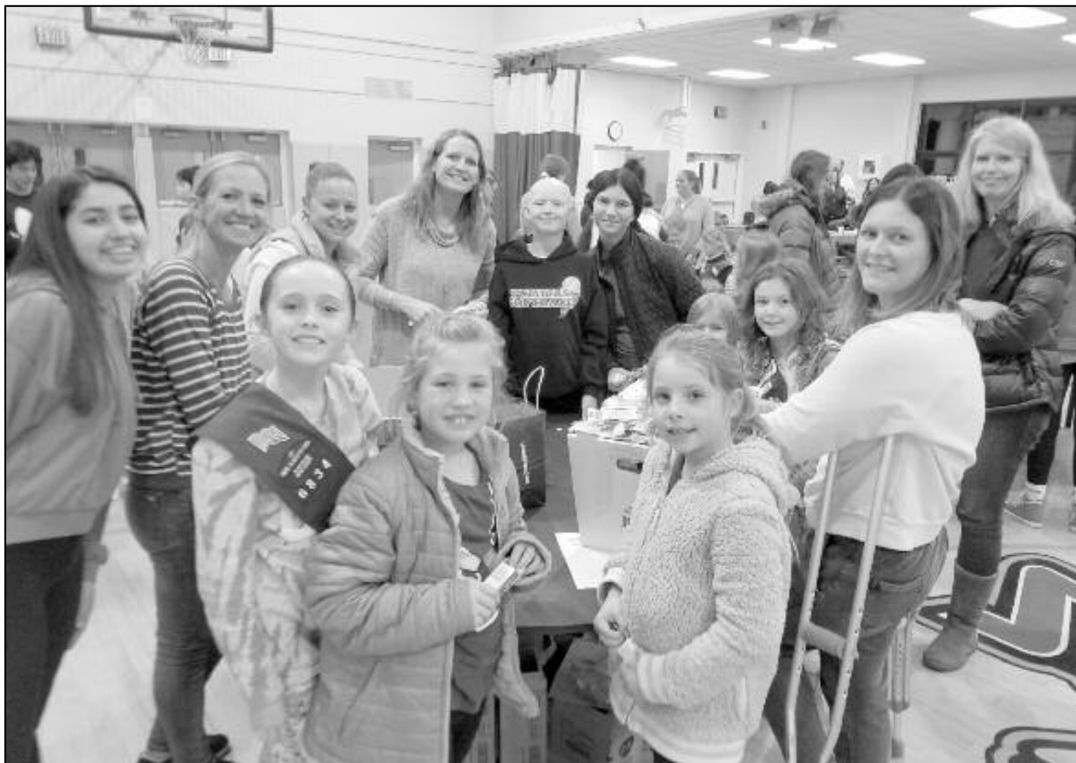
(above) Long Hill's Girl Scouts and their family members created toiletry packs and socks bags for Bridges Outreach, which helps the homeless.