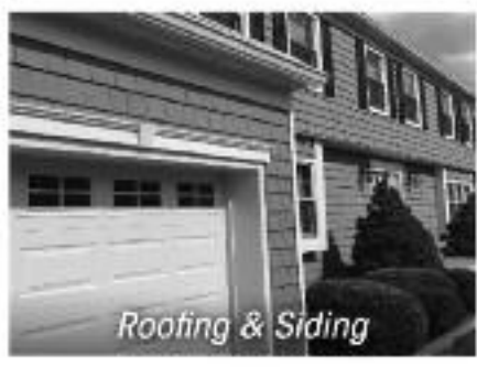
Roofing & Siding