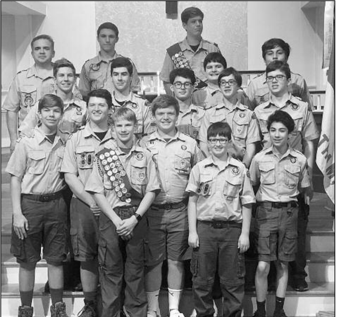
(above) Troop 28 is still thriving since its founding in 1936.