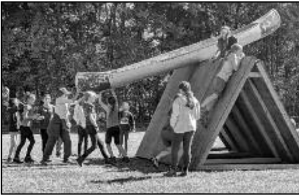
(above) Troop 280 maneuvers a canoe over a fulcrum at a 2019 Jersey Jamboree obstacle course.

Reserve space in the next issue. Call Tina today at 908-418-5586 or email info@rennamedia.com