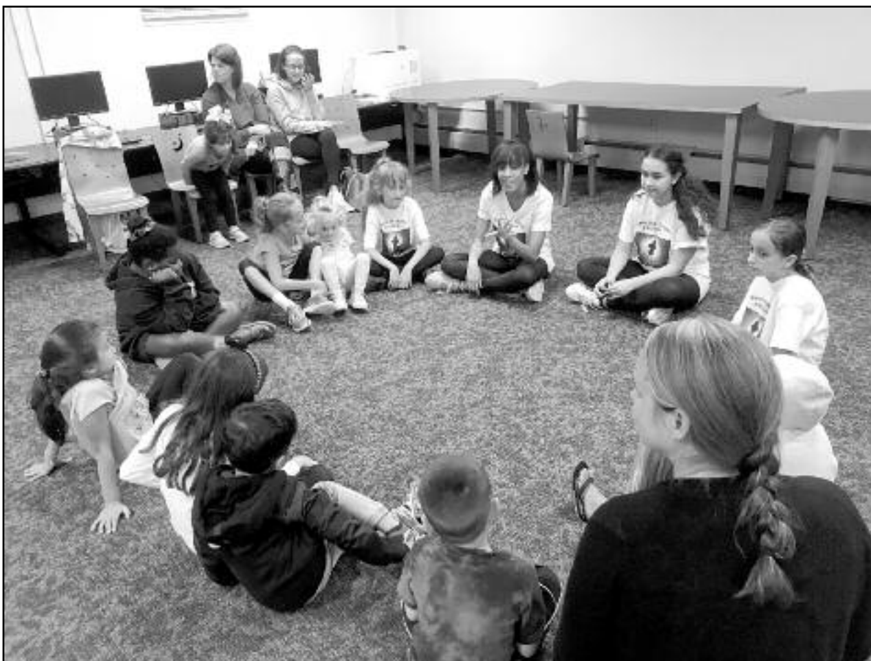
(above) Applause Theater performed songs from Matilda, The Musical and played games with the audience.

Children and their families enjoyed upbeat interactive music highlighting this famous storybook character. Applause Theater members also read stories and presented interactive theater games for the audience members.