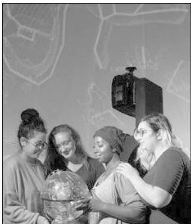
(above) The Kean University Planetarium invites you to experience Seasons of Light, a spectacular light show that combines luminous holiday lights and astronomical astrology.

Experience the magic of Seasons of Light