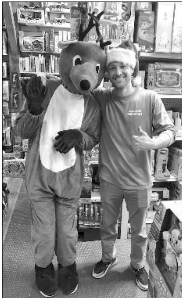
(above) Will you be able to Find Rosie the Rose City Reindeer? Children may participate to win a special prize and enter in the Grand Prize Drawing.