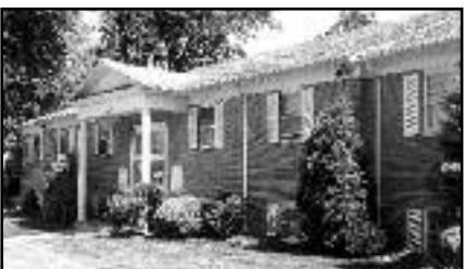
Our Office Today