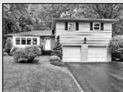
1335 Grandview Avenue, Westfield SOLD