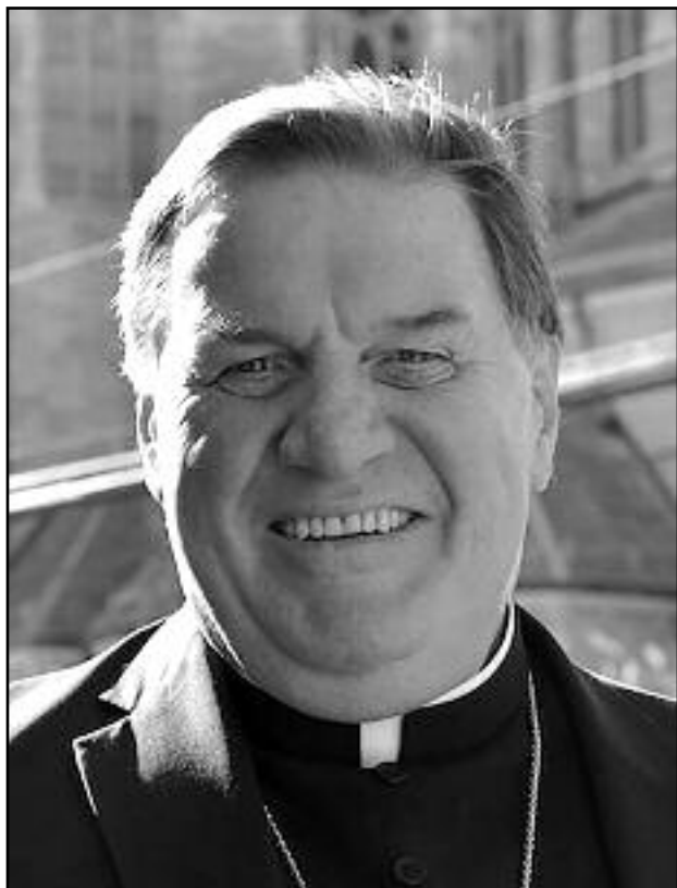
(above) Cardinal Joseph W. Tobin, C.Ss.R., Archbishop of Newark will be the guest speaker.

St. Joseph Social Center invites the community to their Annual Fundraising Raffle Dinner to be held on October 17, 2019 at the Westwood in Garwood.