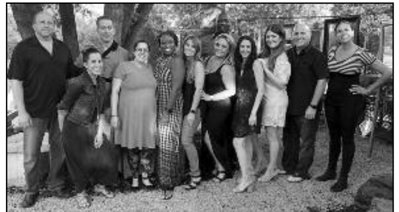
Dentalcare Team Today