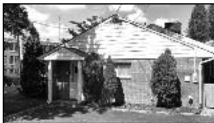
Our First Office