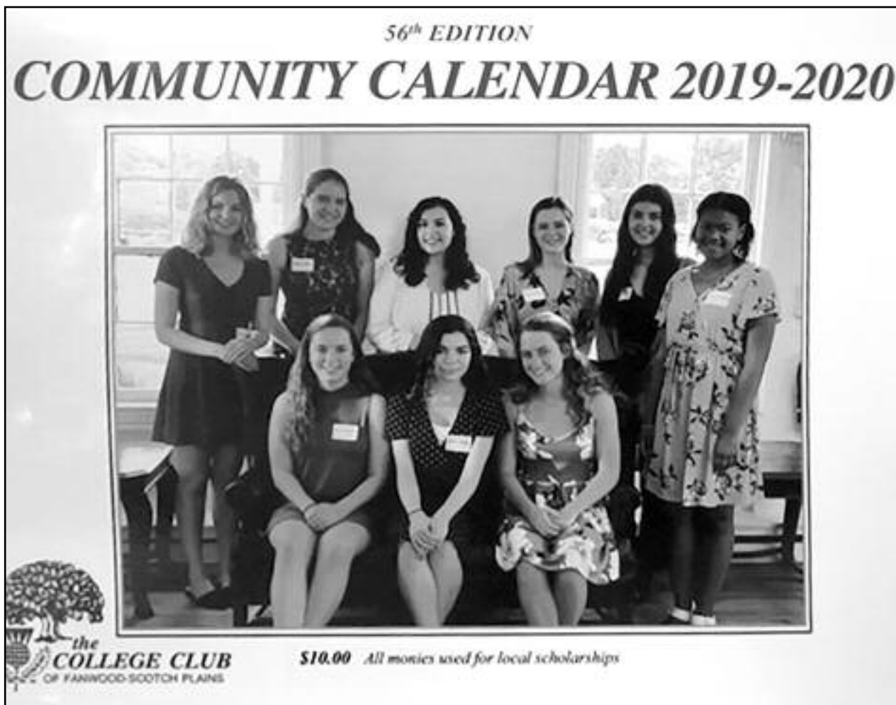
(above) The cover of the 56th edition community calendar of the College Club of Fanwood and Scotch Plains features the 2019 scholarship recipients.

For additional information about the community calendar and the College Club of Fanwood Scotch Plains please visit the website: fspcollegeclub.org .