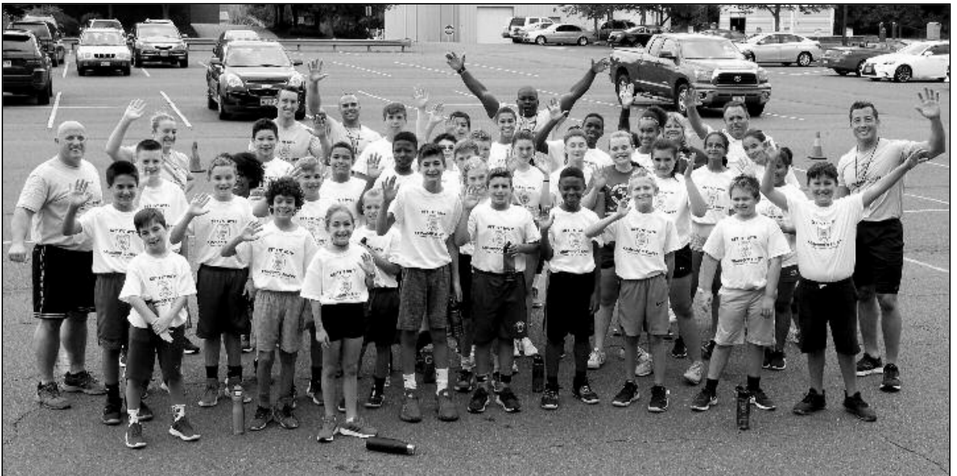
(above) Get Fit With Fanwood's Finest instructors and students.