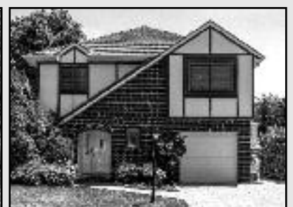
114 Virginia Street, Westfield SOLD