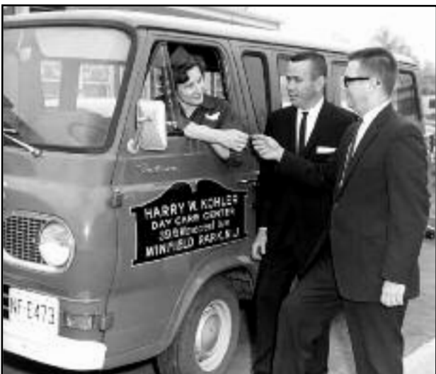
(above) The Arc Kohler School (formerly Harry Kohler Day Care Center) in Winfield Park, NJ is where The Arc of Union County's roots were started, providing services for children and adults with disabilities, including transportation.