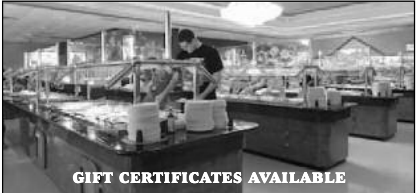
GIFT CERTIFICATES AVAILABLE

10% DISCOUNT Seniors 60+, Military, Police, College Students Hibachi Grill Supreme Buffet (Show ID)