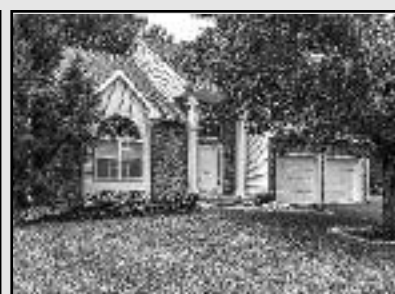
51 Clydesdale Road, Scotch Plains FOR SALE