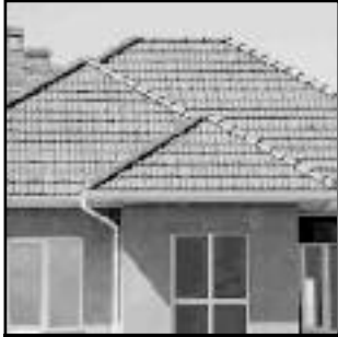
SPANISH STYLE ROOF