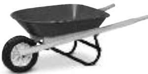
Bon Tool Co.