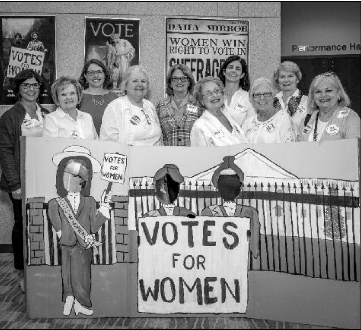
(above) League of Women Voters of Morristown Area members who volunteered to run the Voter Girl Conference.