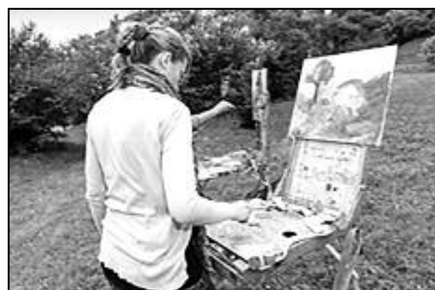
(above) Local artists will be gathering on September 15 for the Expressions of Nature event at The Frelinghuysen Arboretum.

one of the region's best park systems in the state of New Jersey. It currently protects and maintains 20,197 acres at 38 distinct sites plus offers a year-round calendar of events and activities for all to enjoy!