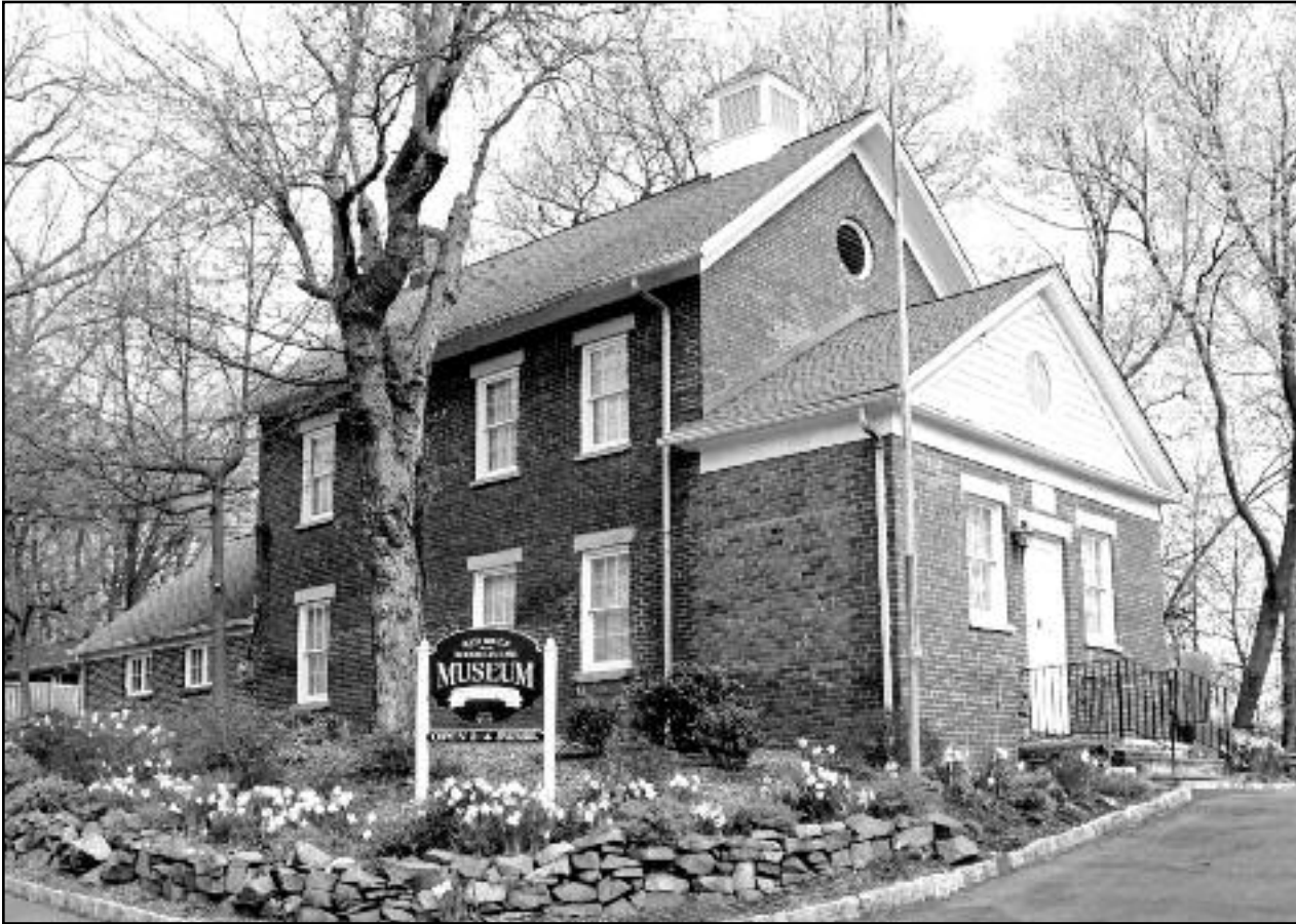
(above) The Red Brick Schoolhouse will be evaluated for a Preservation Plan and will be nominated to the state and federal Historic Register thanks to a Morris County Preservation Fund grant.