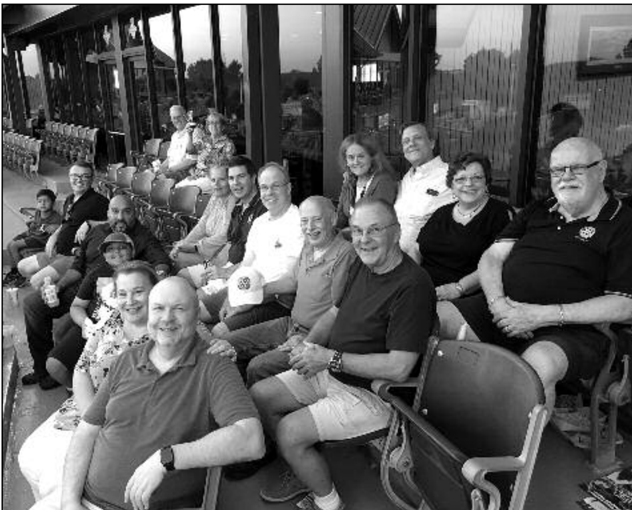
(above) 25 Madison Rotarians and guests recently enjoyed a Somerset Patriots baseball outing at TD Ballpark.