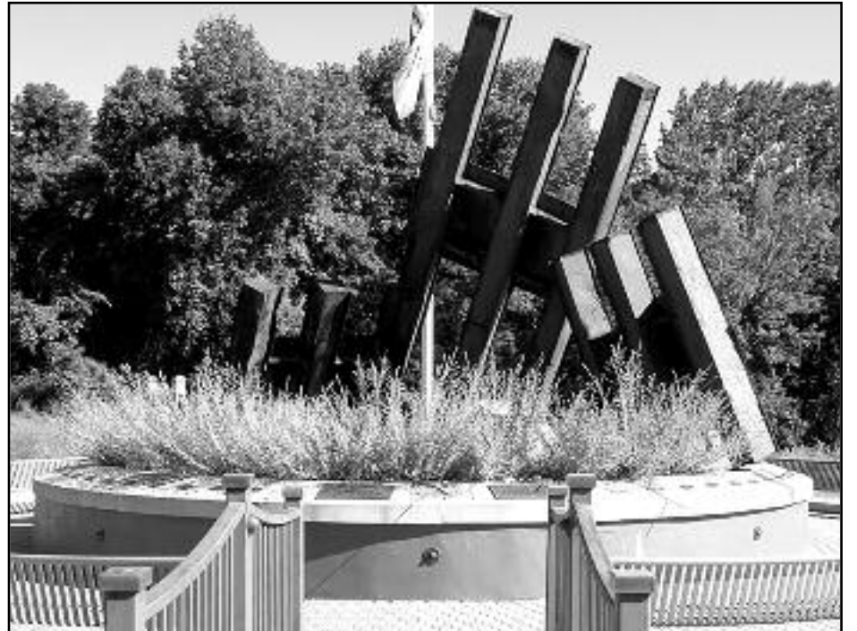
(above) The Morris County September 11th Memorial is located on West Hanover Avenue (460 W Hanover Ave, Morristown, NJ) across from the Morris View Healthcare Center.

The observance will include a special invocation, a lighting of candles, and reading of the names of each of the 64 Morris County