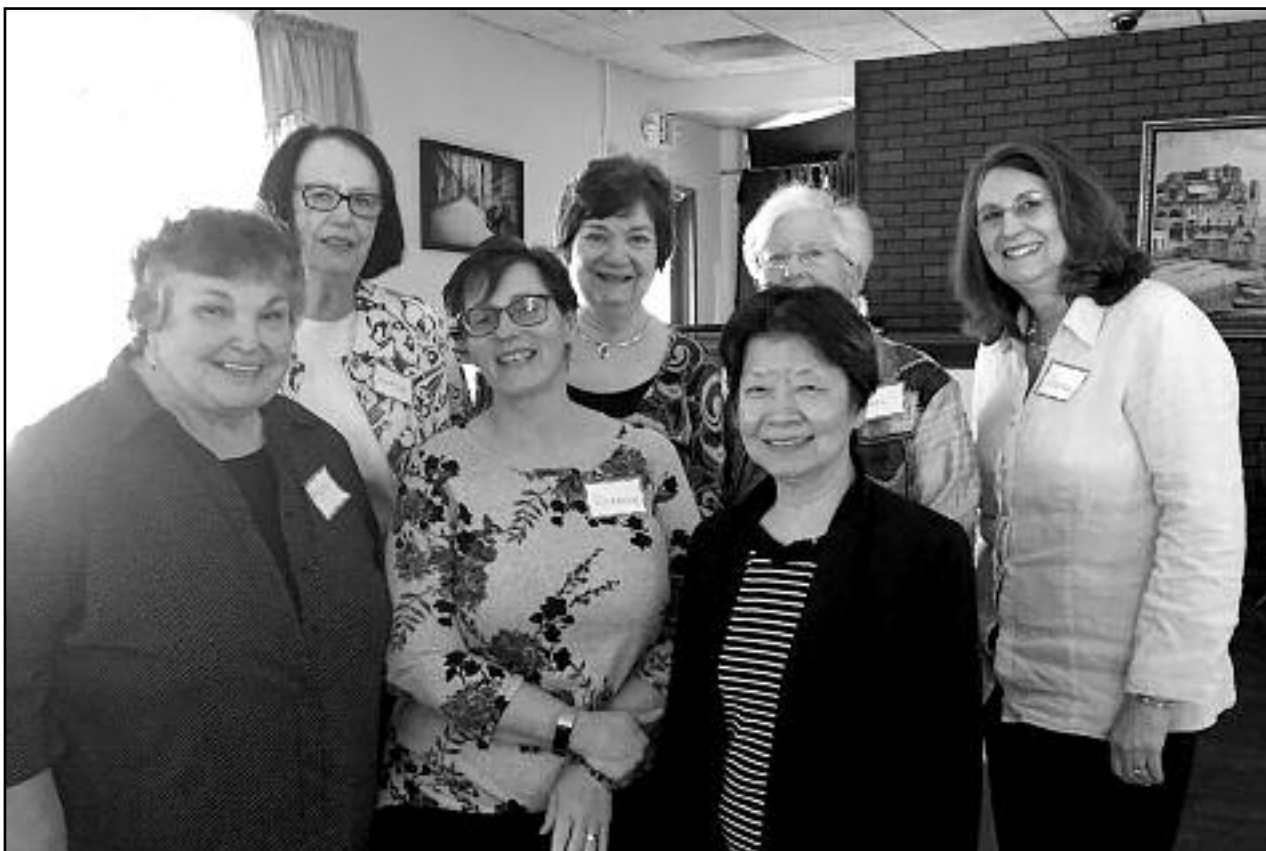
(above, l-r) New officers of WCBH installed on May 21, 2018 at Ancona Bistro.

We hope to see some new faces at the meeting!