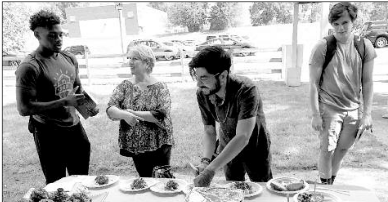
(above) Participants from the 2018 Vegan Cookoff.

For more information about Vegan Fest, answers to FAQs, directions to events, and the Vegan Quest pledge, as well as the sign-up link to be a competitor in the Vegan Cook-Off, please visit: sustainablebh.org/home/veganfest-2019 or berkeleyheights.gov/387/Vegan-Fest .