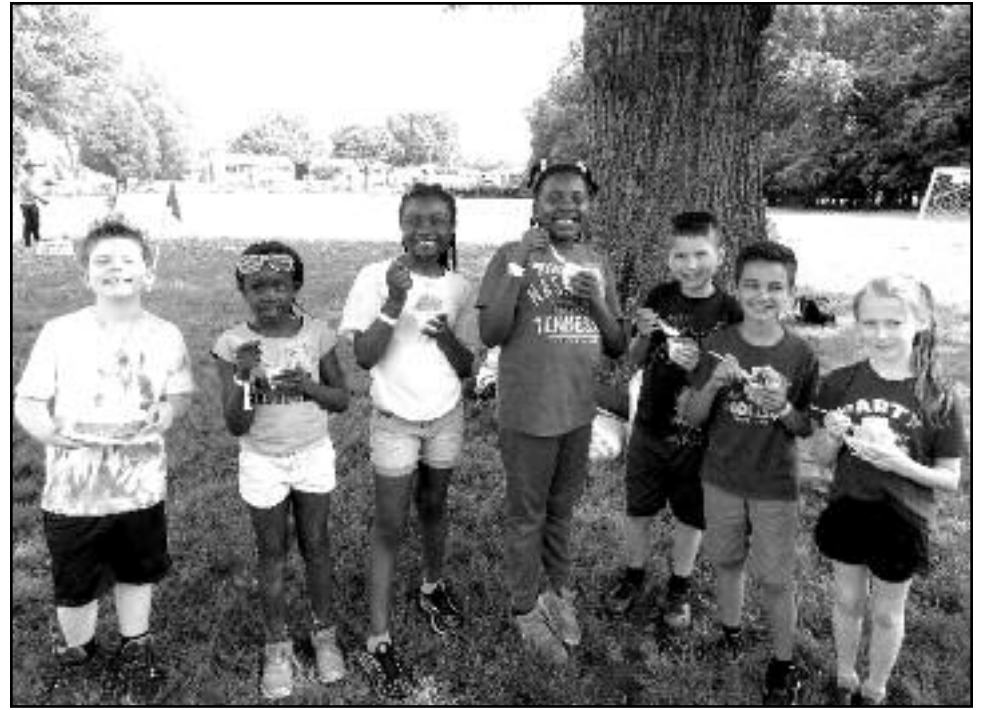
(above) The students of Battle Hill enjoying the Kick off Party.

"We're so proud how the Battle Hill community has come together to support our Relay for Life team! Our students and staff show how they can make a difference! It's so