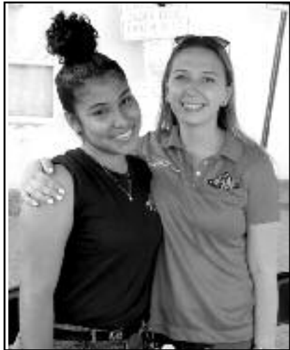
(above) Texas Roadhouse, 1258 Route 22, North Plainfield