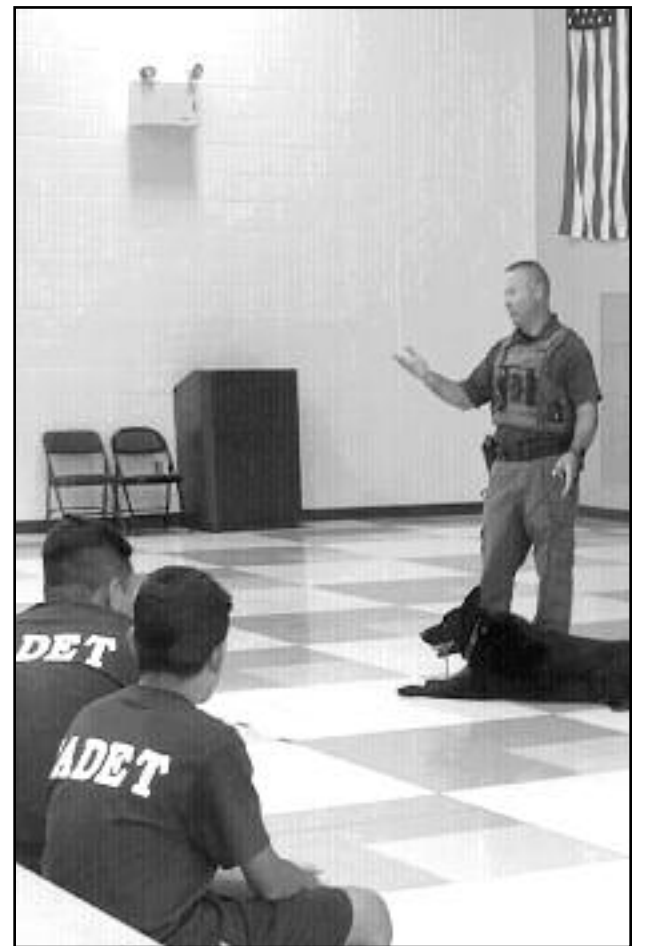
(above) Somerset County Sheriffs officer with his k9 partner instructing the class.