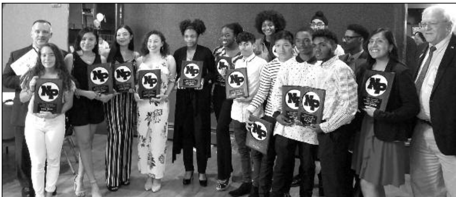
(above) The Optimist Club of North Plainfield honored 16 student athletes from each sporting group in North Plainfield who demonstrated traits that align with the Optimist Creed.

If you would like to learn more about the Optimist Club of North Plainfield, please contact Sandi Helck at 908-361-2152. New members are always welcome.