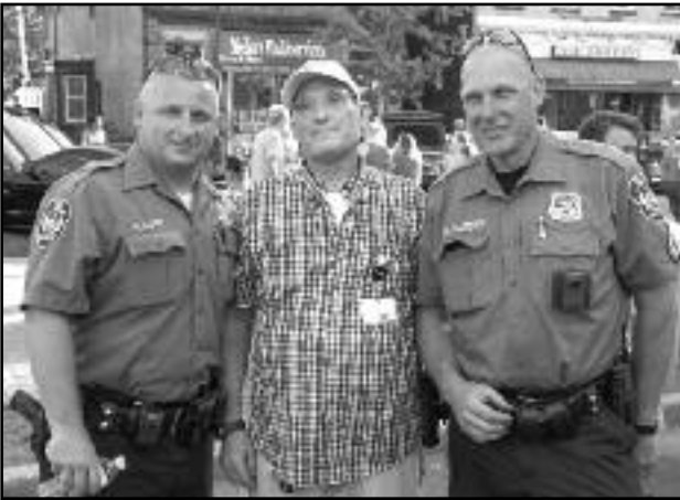
(above) Costco, 1290 Route 22, North Plainfield