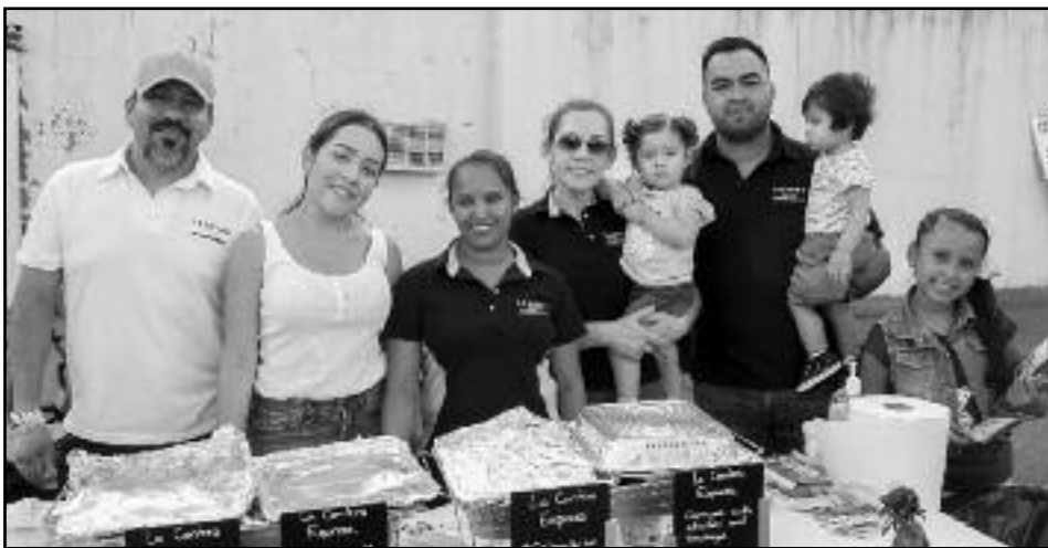
(above) La Cantera, 18 Somerset Street, Plainfield