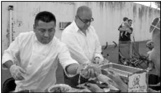
(above) Tequila and Tacos, 560 Stelton Road, Piscataway

On Monday, July 15th, 2019, The North Plainfield Business Association (NPBA), Mayor's Special Events, and the Car Nutz Car Club hosted the Taste of North Plainfield and Summer Car Cruise. Somerset Street was closed off for two blocks on a beautiful summer evening as people from all over town came out to see classic cars and enjoy some great food – all for free. There was a DJ spinning tunes which