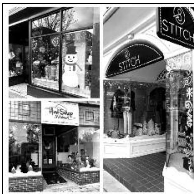
(above) The Madison High School Art students partner with Madison Area Chamber of Commerce businesses to help brighten the downtown businesses district with their holiday artwork. Students paint store front windows and doors and help to make Madison more festive during holiday season. All artwork is completed in time for the annual Christmas Walk.