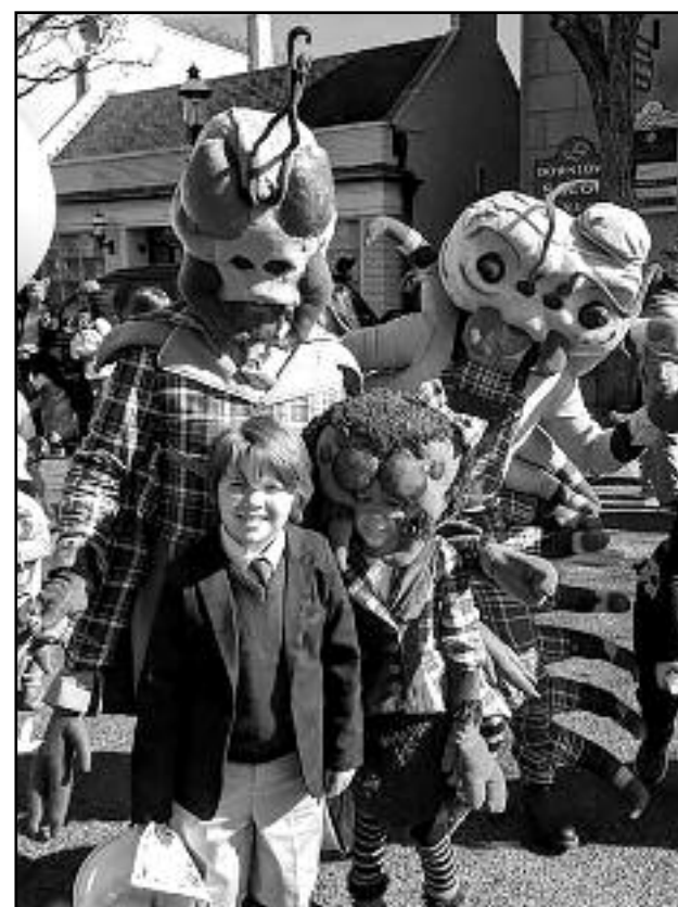
(above) Some spooky participants of the Madison Chamber of Commerce 2018 Halloween Parade.