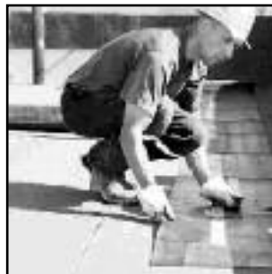
FLAT TOP ROOF