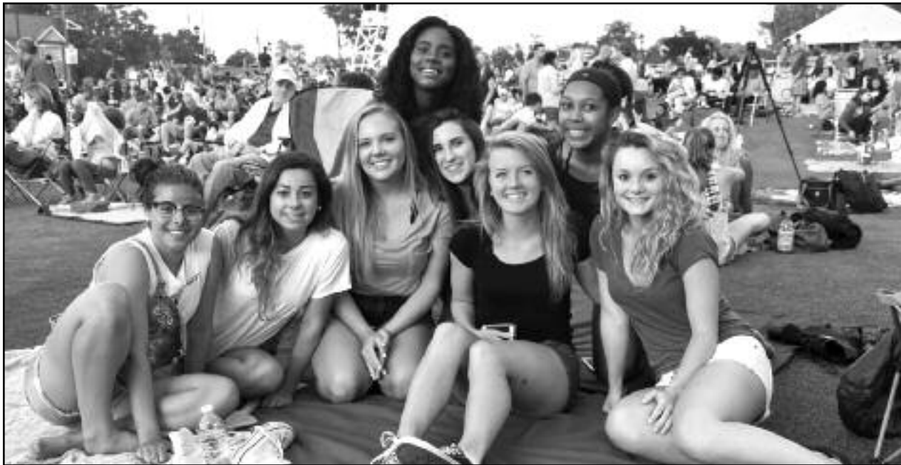
Photos from 2016 Independence Day can be found online at rennamedia.com and on the Fanwood Post page on facebook.com . Feel free to "Like", "Tag" and "Share."

For more information please contact the Manager's Office at (908)322-6700 Ext. 314.