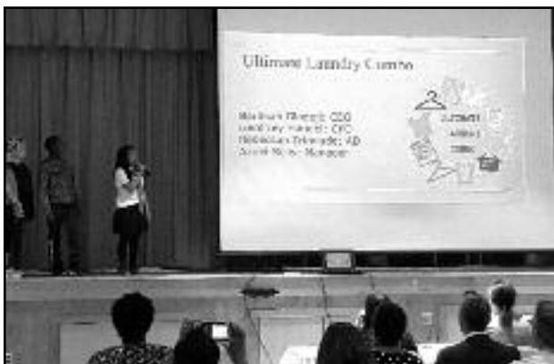
(above) 2nd place winners from Connecticut Farms during their presentation of Ultimate Laundry Combo.