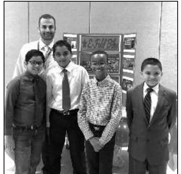
(above) E-Fold Bike team members pose in front of their poster.