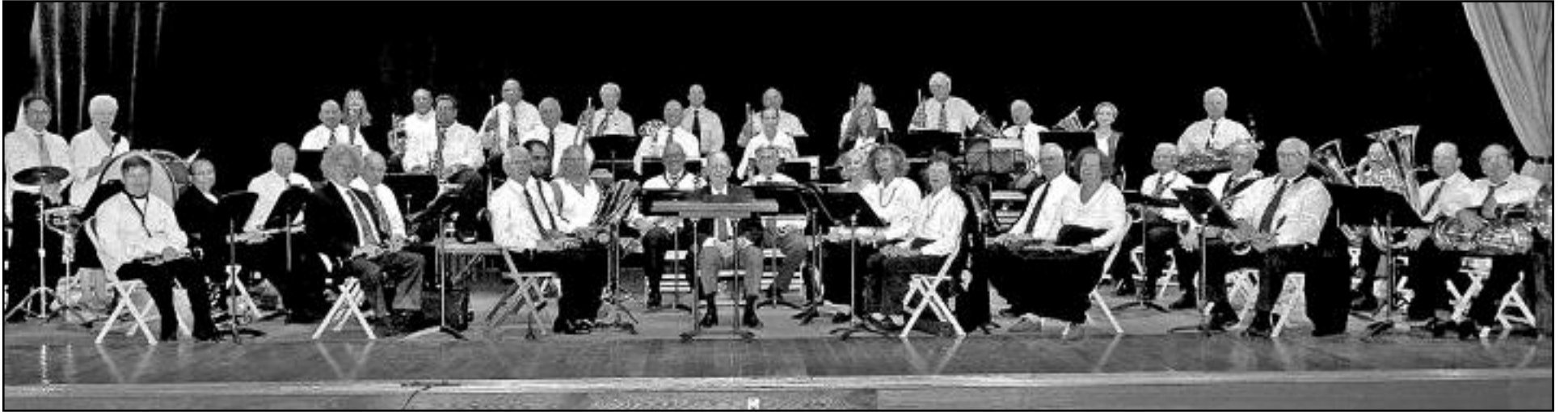
(above) The Union Municipal Band will be performing summer concerts for the public on July 8 and July 15, 2019.