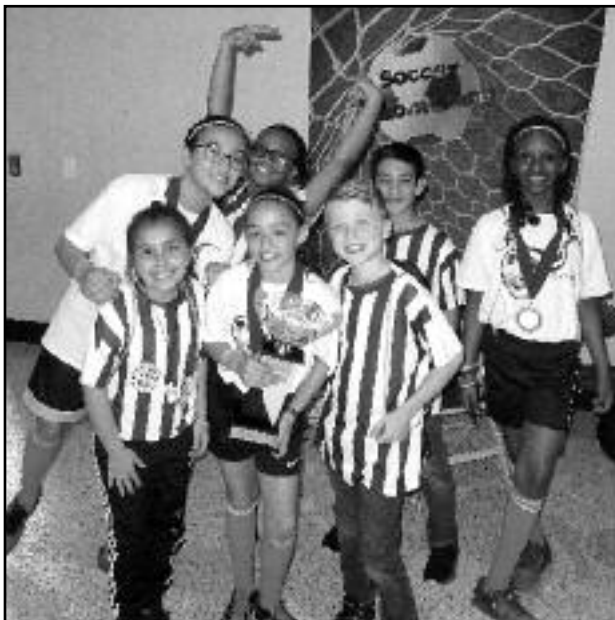
(above) Battle Hill Students were awarded first place for their Soccer Boomerang proposal.