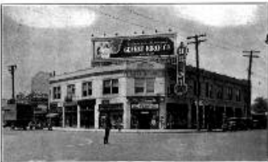
Union Center, Union, N.J.

Sponsored by the Union Township Historical Society