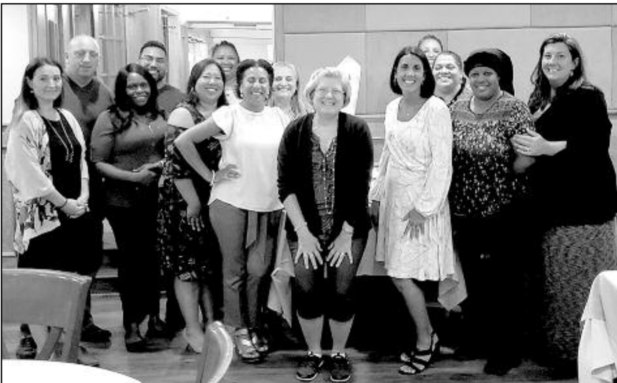
(above) Outgoing and incoming PTA presidents.

Each year the Union Township Parent Teacher Associations (PTA) gathers to induct the incoming presidents. This year the Battle Hill PTA hosted the dinner at the Spanish Tavern on Wednesday, June 12th, 2019. School principals, PTA executive board members, Board of Education members, parents and staff came together to celebrate the induction. A candle lighting ceremony symbolizing all that the PTA stands for, took place.