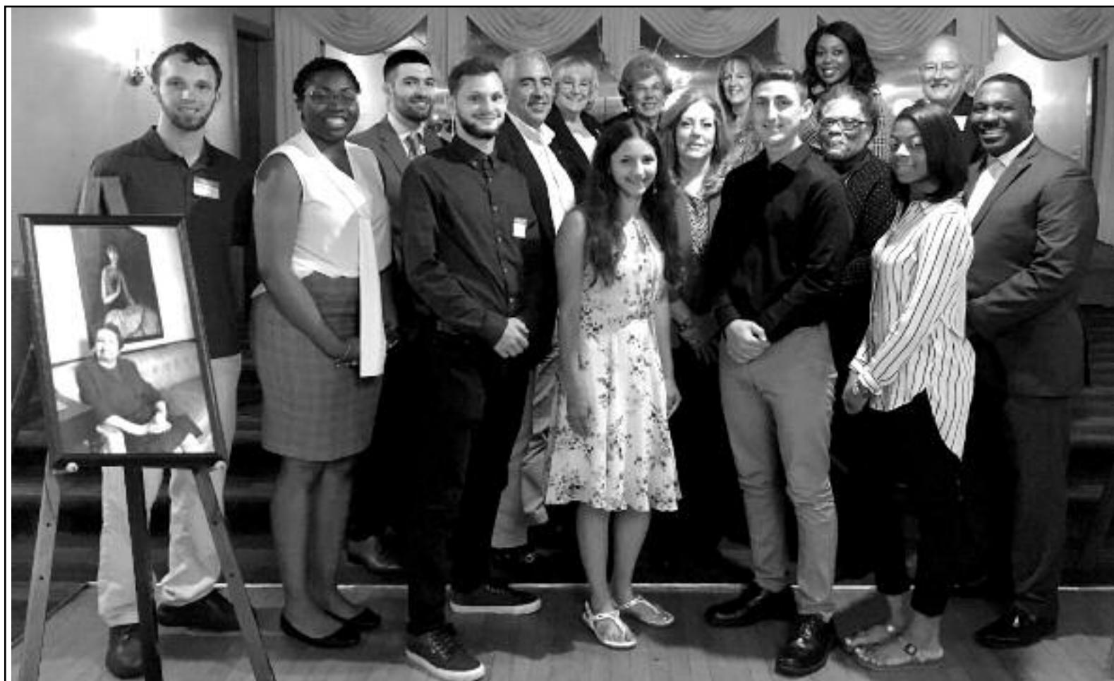
(above) Students from Plainfield, North Plainfield and South Plainfield high schools during the Adele DeLeeuw Scholarship Fund dinner.