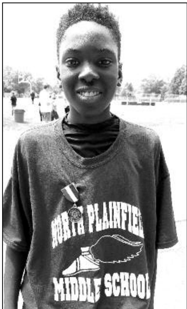
(above) Rotary Club of the Plainfields' Track Meet winner of the 55 meter event proudly wears his medal.

Interested in serving others? The Rotary Club of Plainfield-North Plainfield welcomes visitors to any weekly meeting, visit RotaryPNP.org .