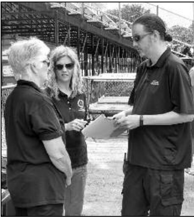
(above) Rotary Club of the Plainfields' Track Meet officials confer before races begin.