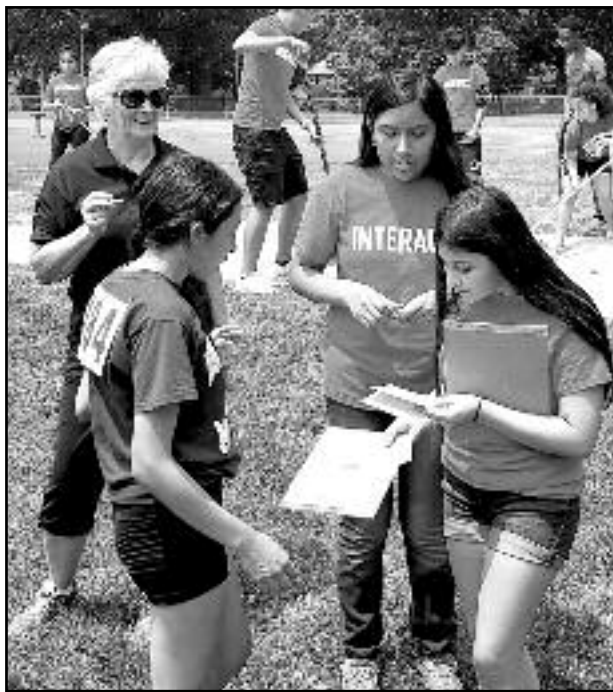
(above) Rotary Club of the Plainfields' Track Meet winners of a track event get their awards slips to claim their medals.