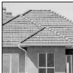
SPANISH STYLE ROOF