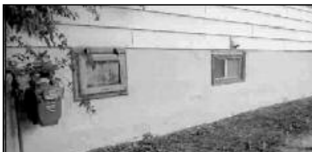
FOUNDATION REPAIRS BEFORE & AFTER