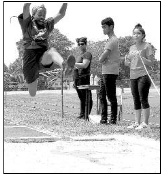
(above) Jumping to a medal at the Rotary Club of the Plainfields' Track Meet.