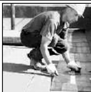
FLAT TOP ROOF