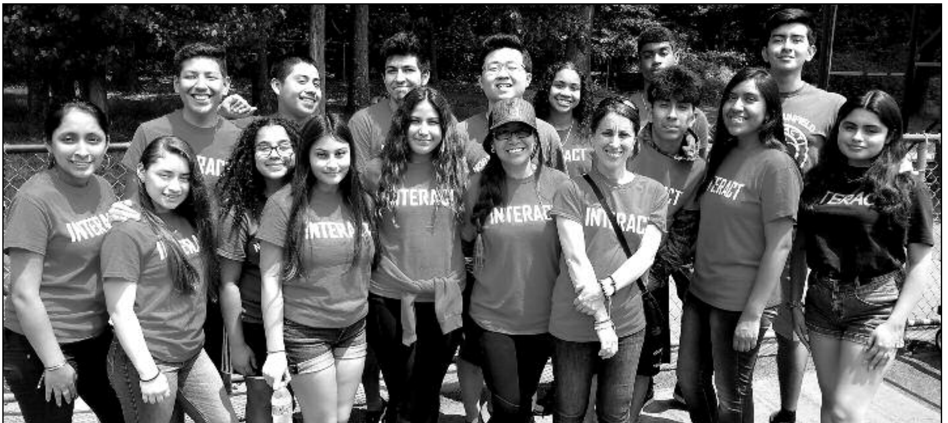
(above) North Plainfield High School Interact Club members and advisors who assisted officiating at the Rotary Track and Field Meet.