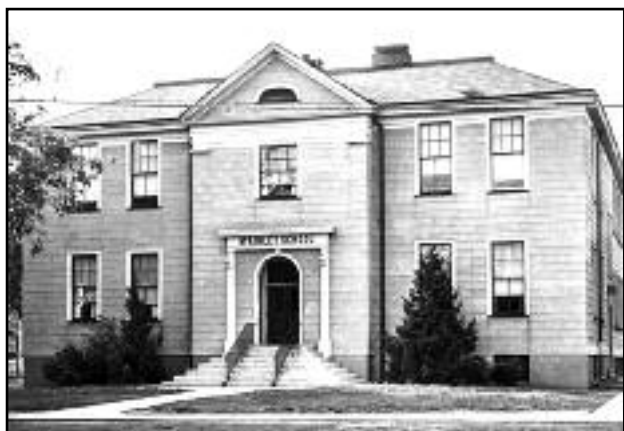
(above) Old McKinley School (1963) where Sunbeams often met.