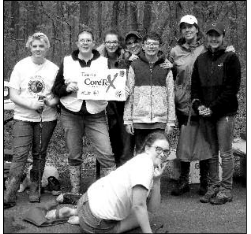
(above) Volunteers collected 12 bags of trash during Warren's first Cache in Trash Out (CITO) event.